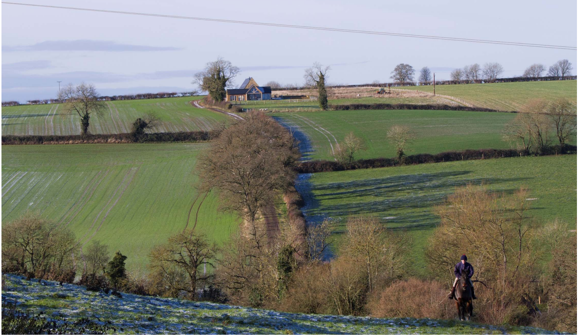
View from bridle path across to converted Haynes Barn 13/00930/F with glazed wall, ridge height increased by 1.5 metres and 8 Velux windows introduced