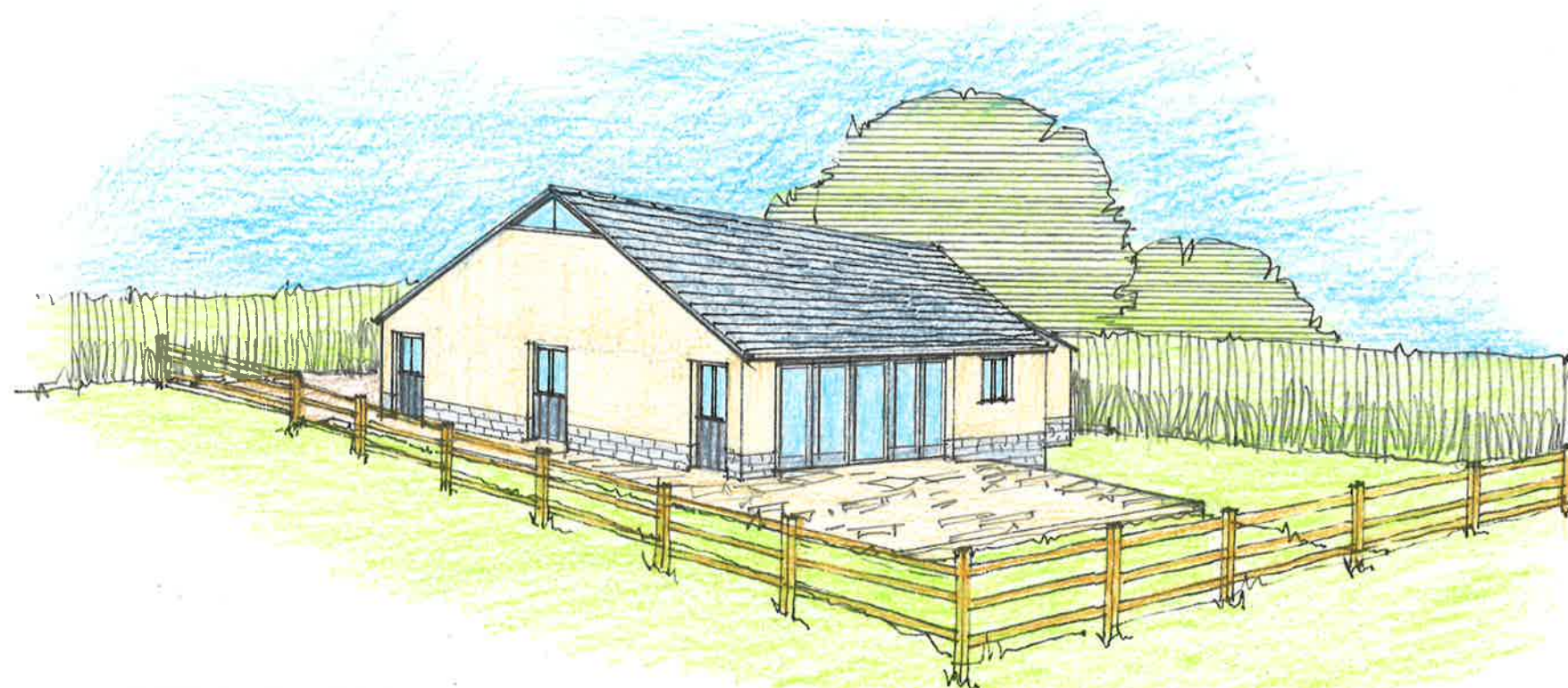
SKETCH FROM THE SOUTH (NTS)