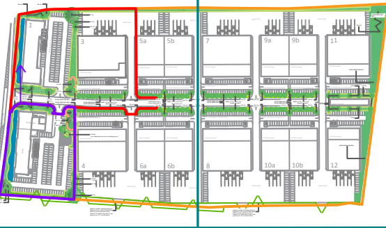
PLAN PART A PLAN PART B

Please also refer to part B of this drawing.