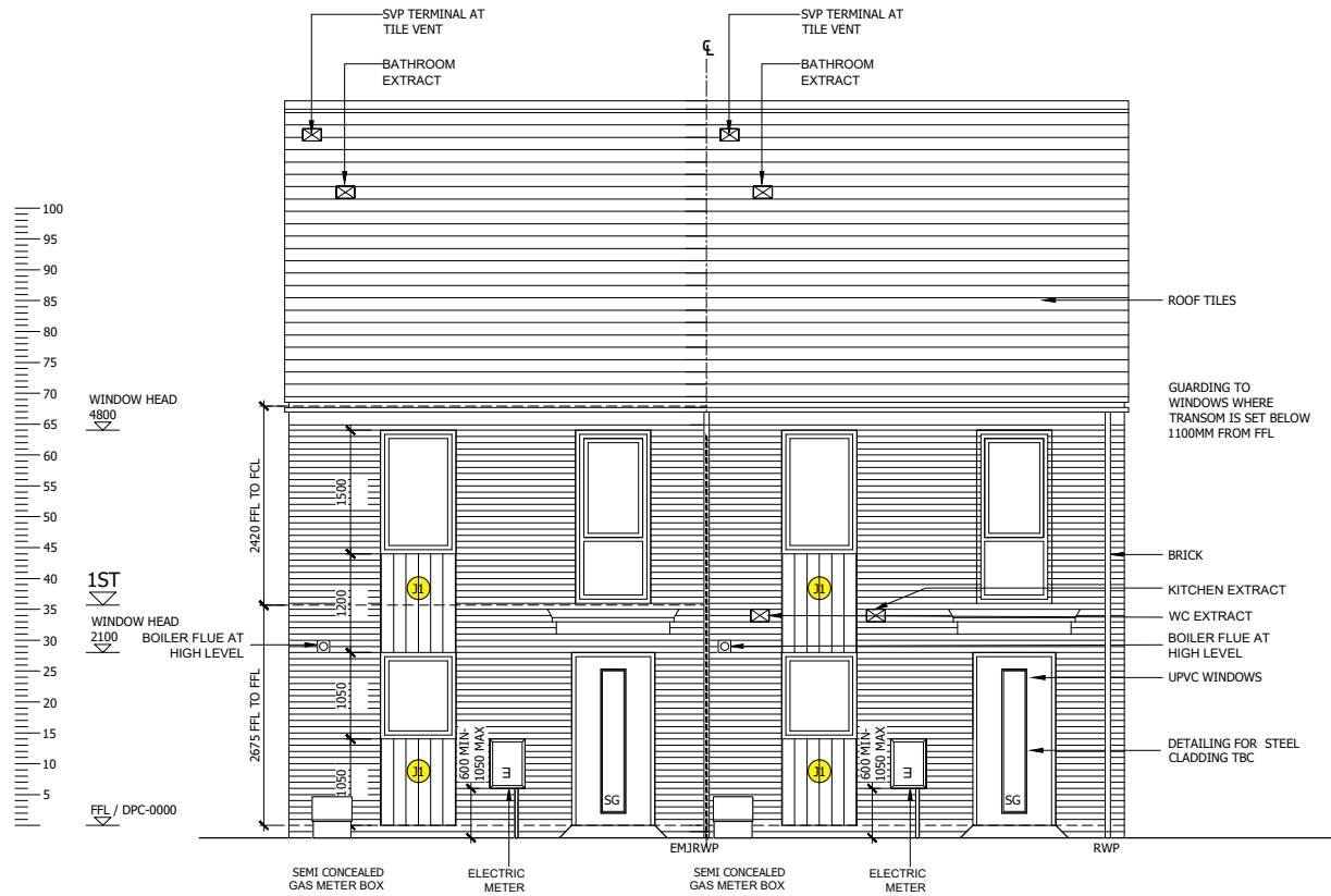
FRONT ELEVATION PLOTS 382-383