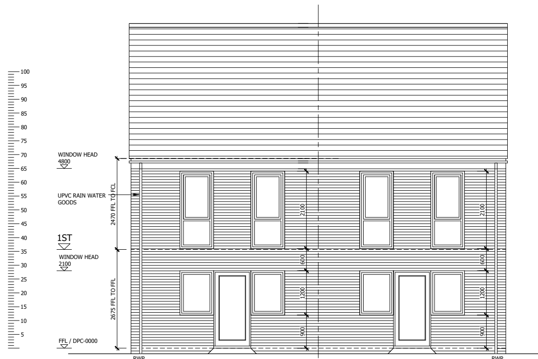
REAR ELEVATION PLOTS 382-383