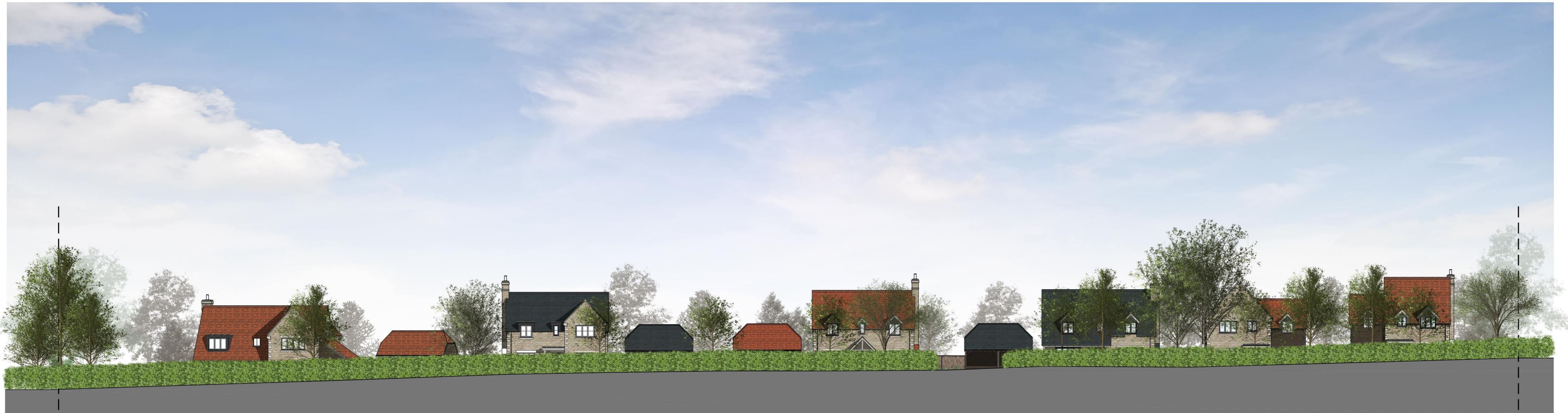
Street scene from South Side Road