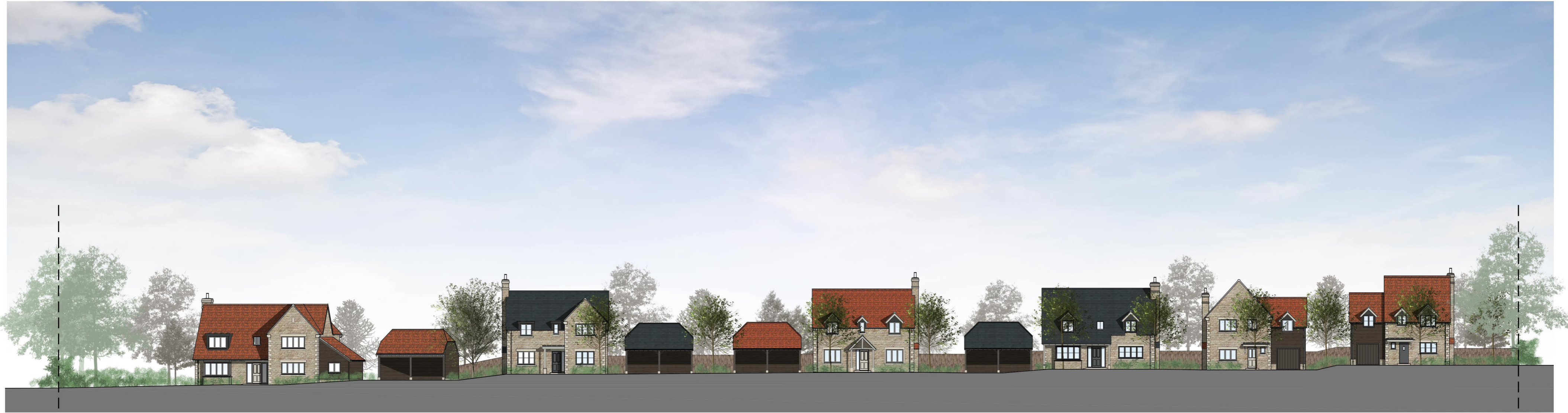
Street Scene from on site road