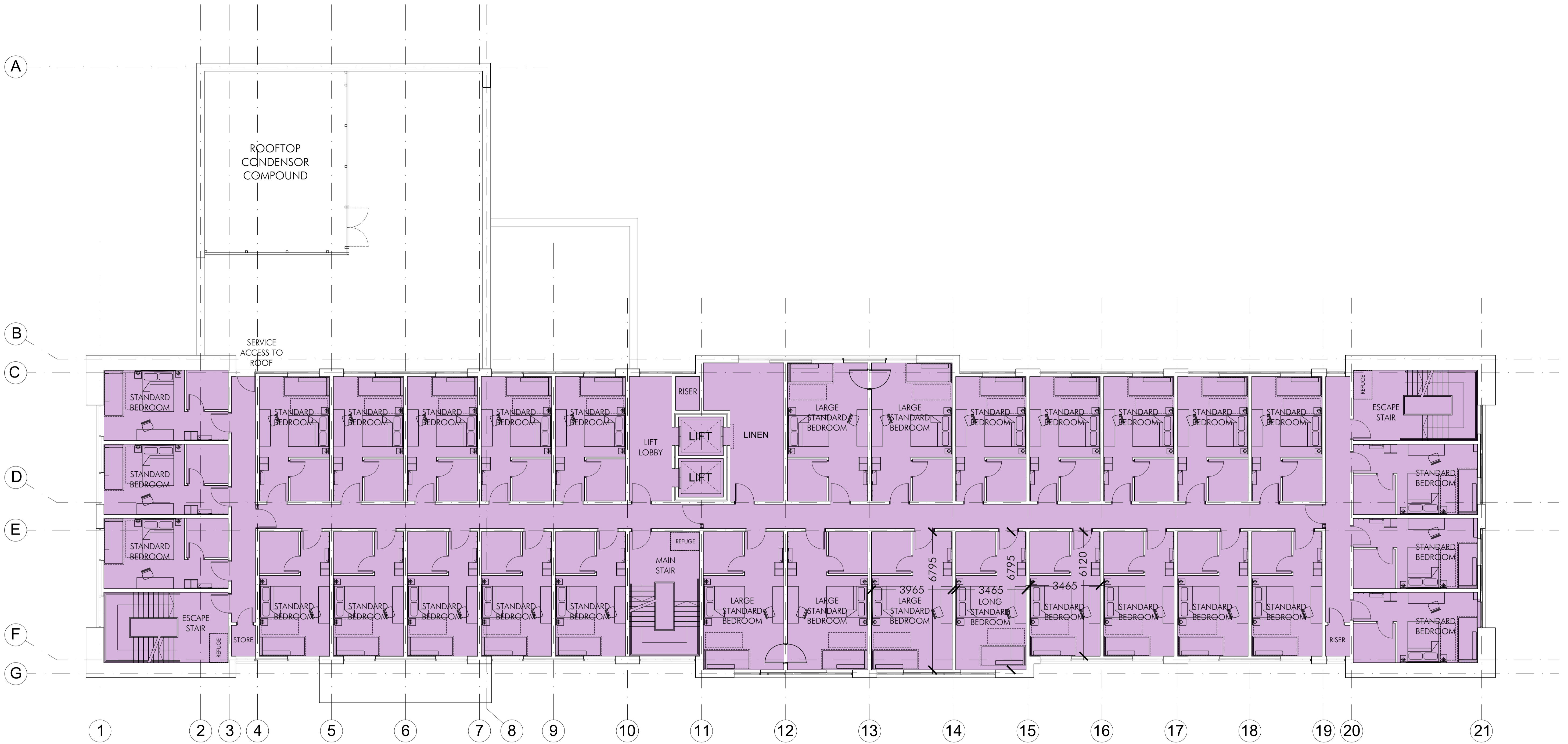
SECOND FLOOR PLAN SCALE 1:100 @ A1