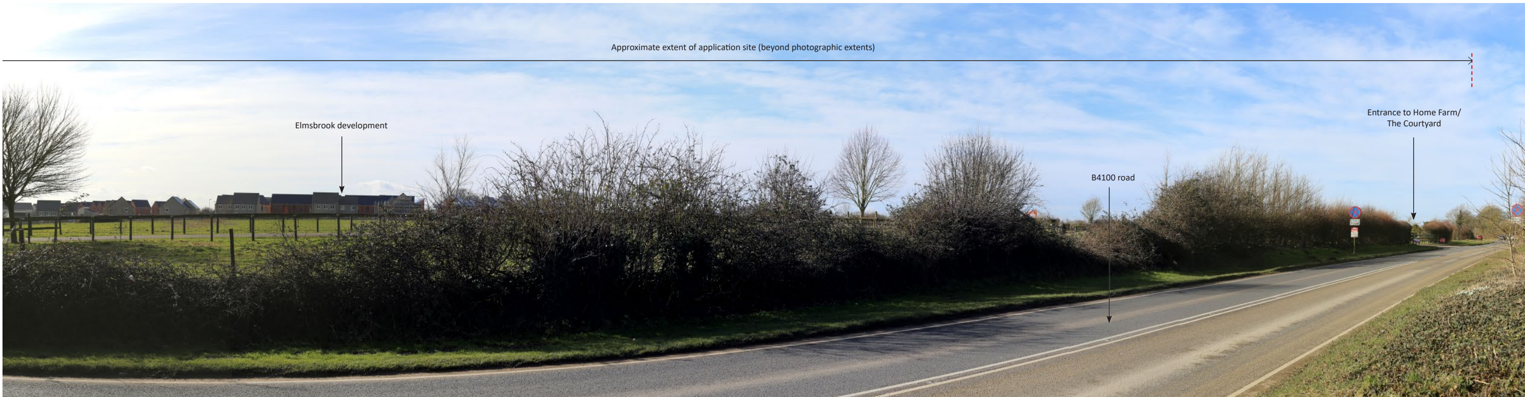
Viewpoint 5a - View northwest from B4100 outside Church of St. Laurence