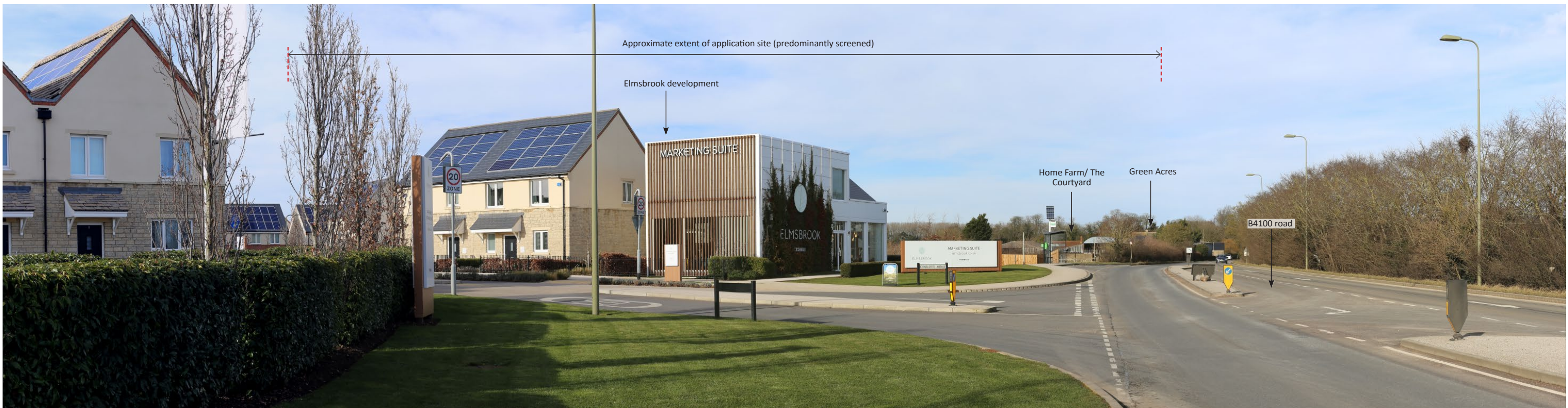
Viewpoint 11 - View north from B4100 at entrance to Elmsbrook development (intersection with Charlotte Avenue)