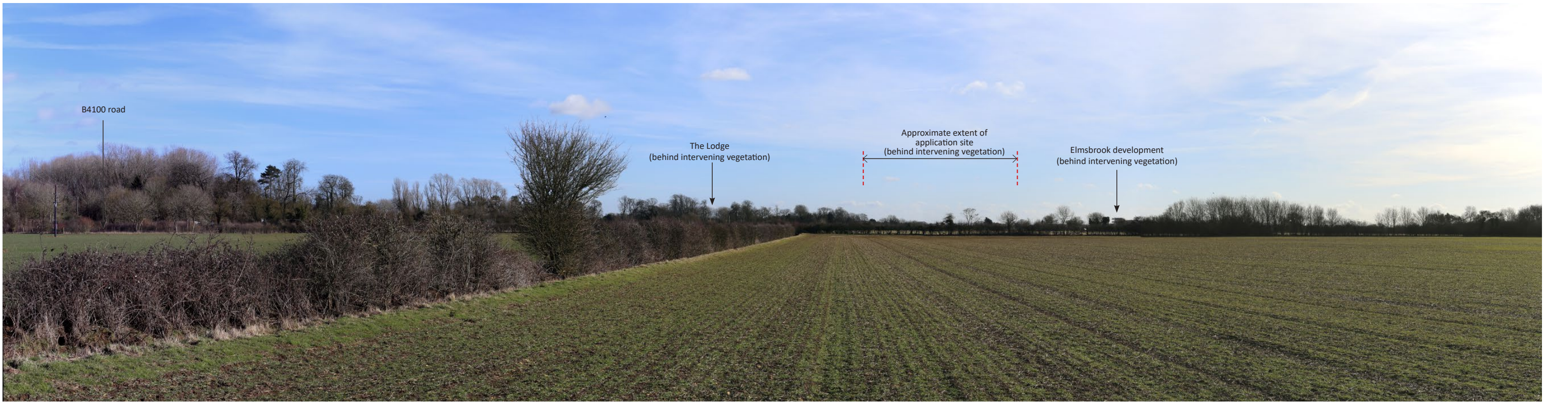
Viewpoint 1 - View south from public footpath 148/7 between B4100 and Bucknell