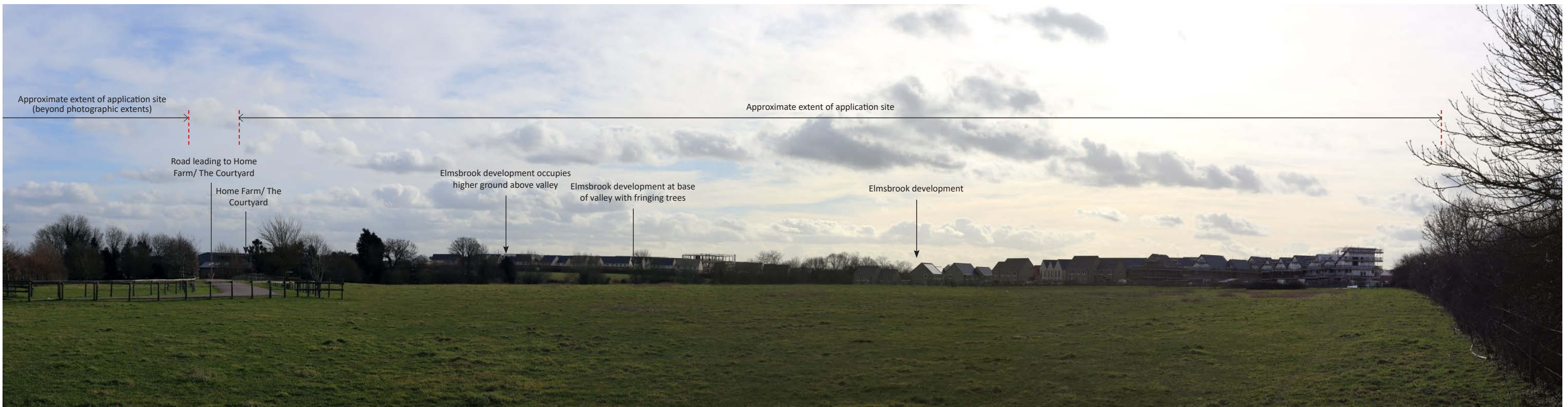
Viewpoint 4 - View from north-east corner of site