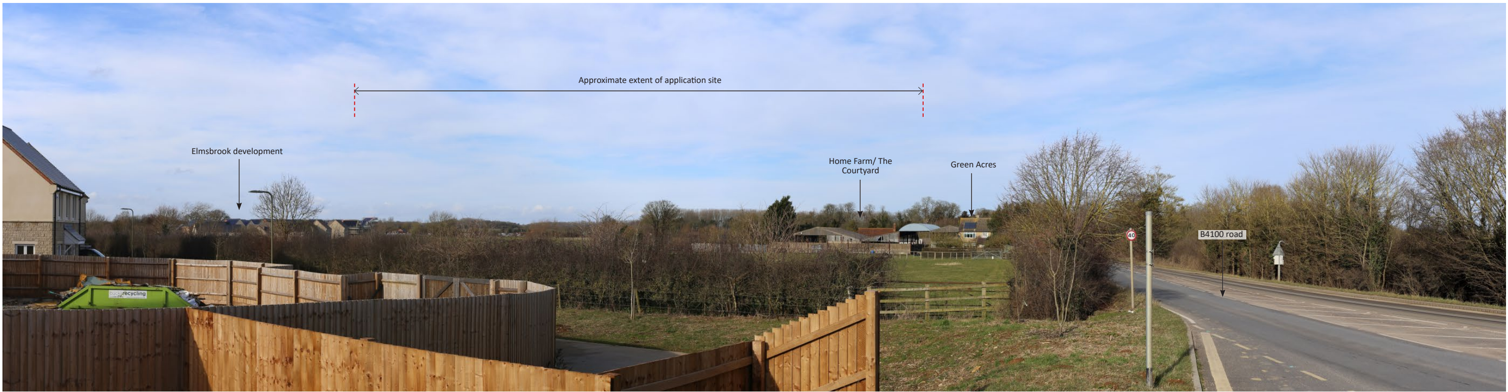
Viewpoint 10 - View north from B4100 by bus stop adjacent to Elmsbrook development