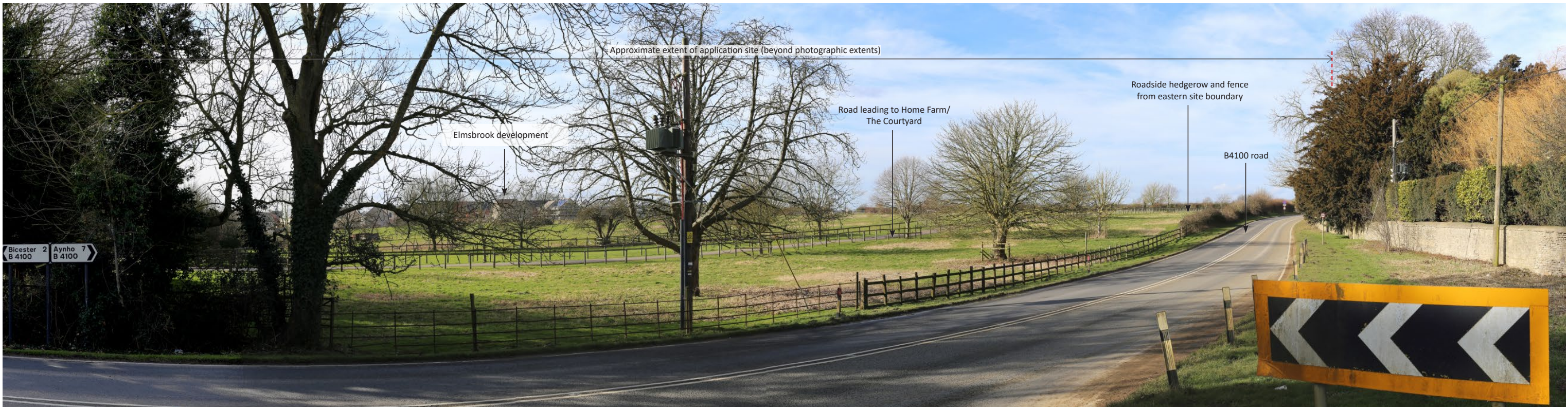
Viewpoint 7 - View northwest from junction of B4100 and Aunt Ems Lane