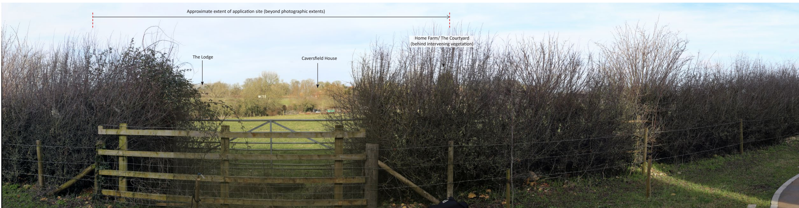
Viewpoint 9 - View north from gap and hedgerow adjacent to residential houses on northern edge of Elmsbrook development