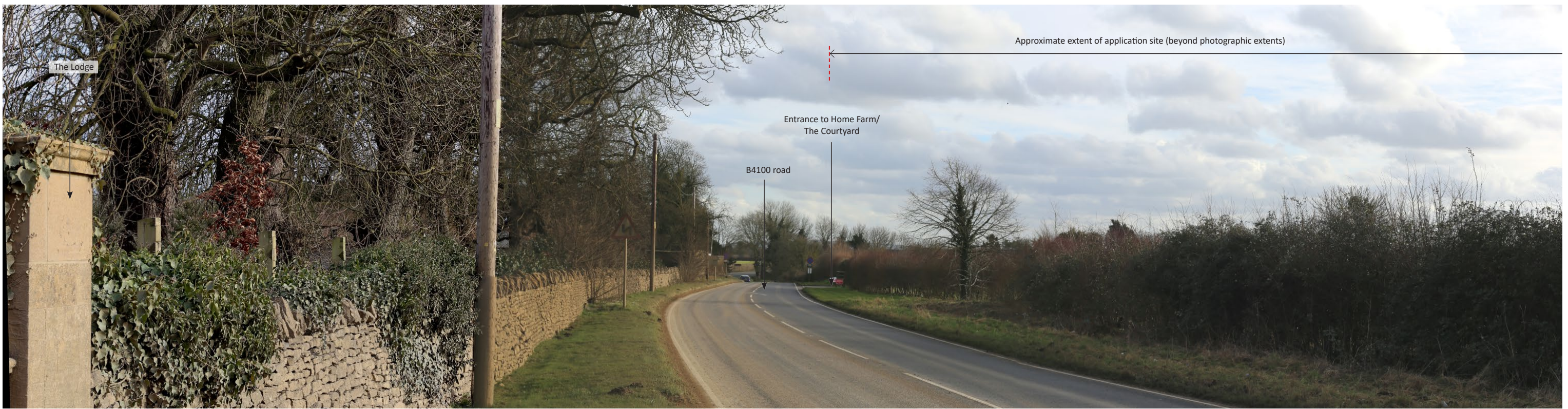
Viewpoint 3 - View south from the B4100 adjacent to the Lodge