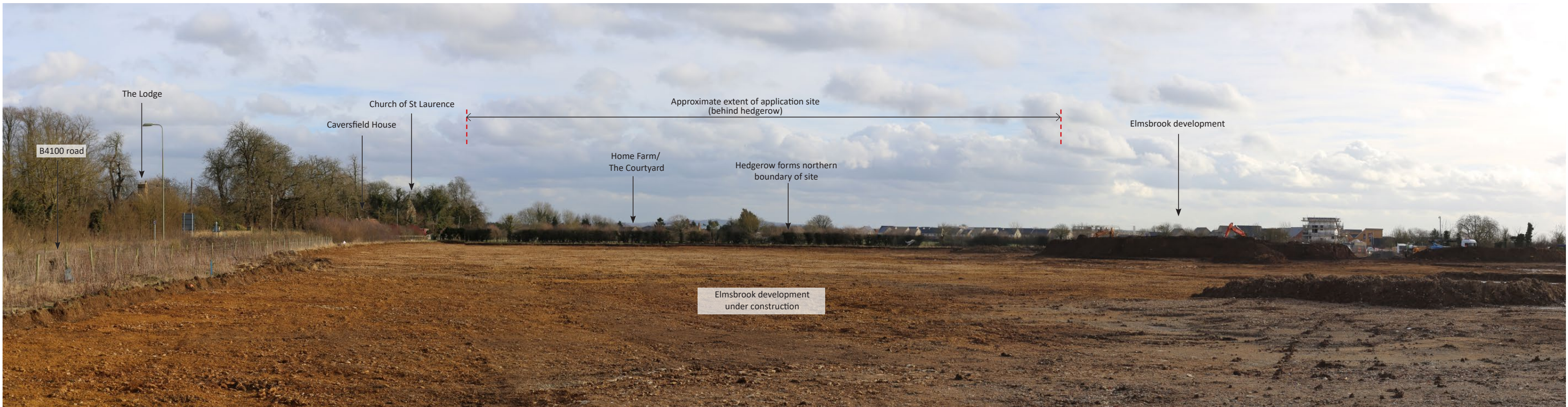
Viewpoint 2 - View south from junction of new housing and B4100