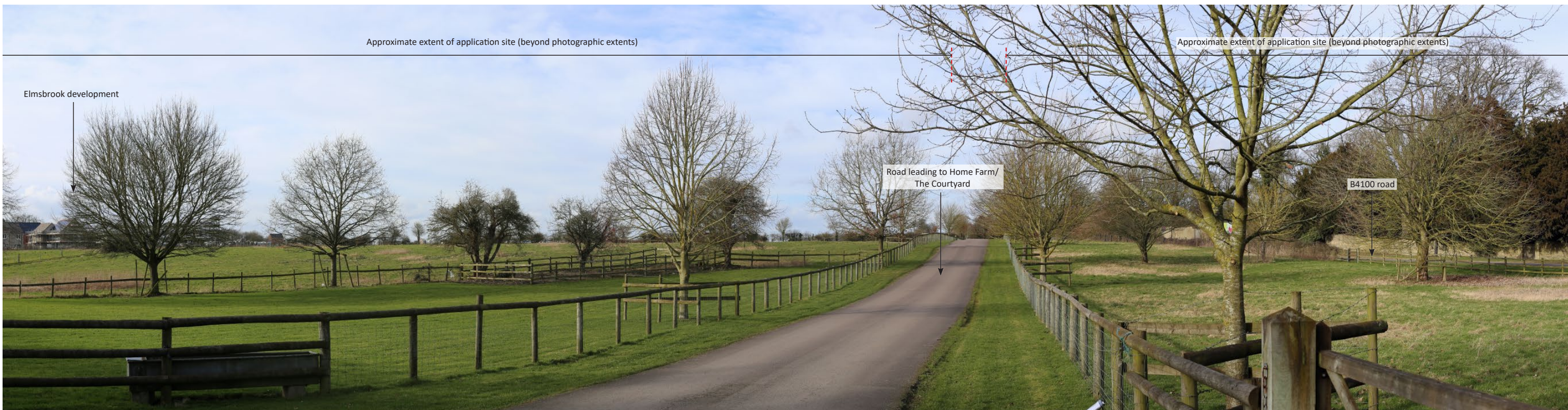
Viewpoint 8 - View north from entrance to Home Farm along southern site boundary