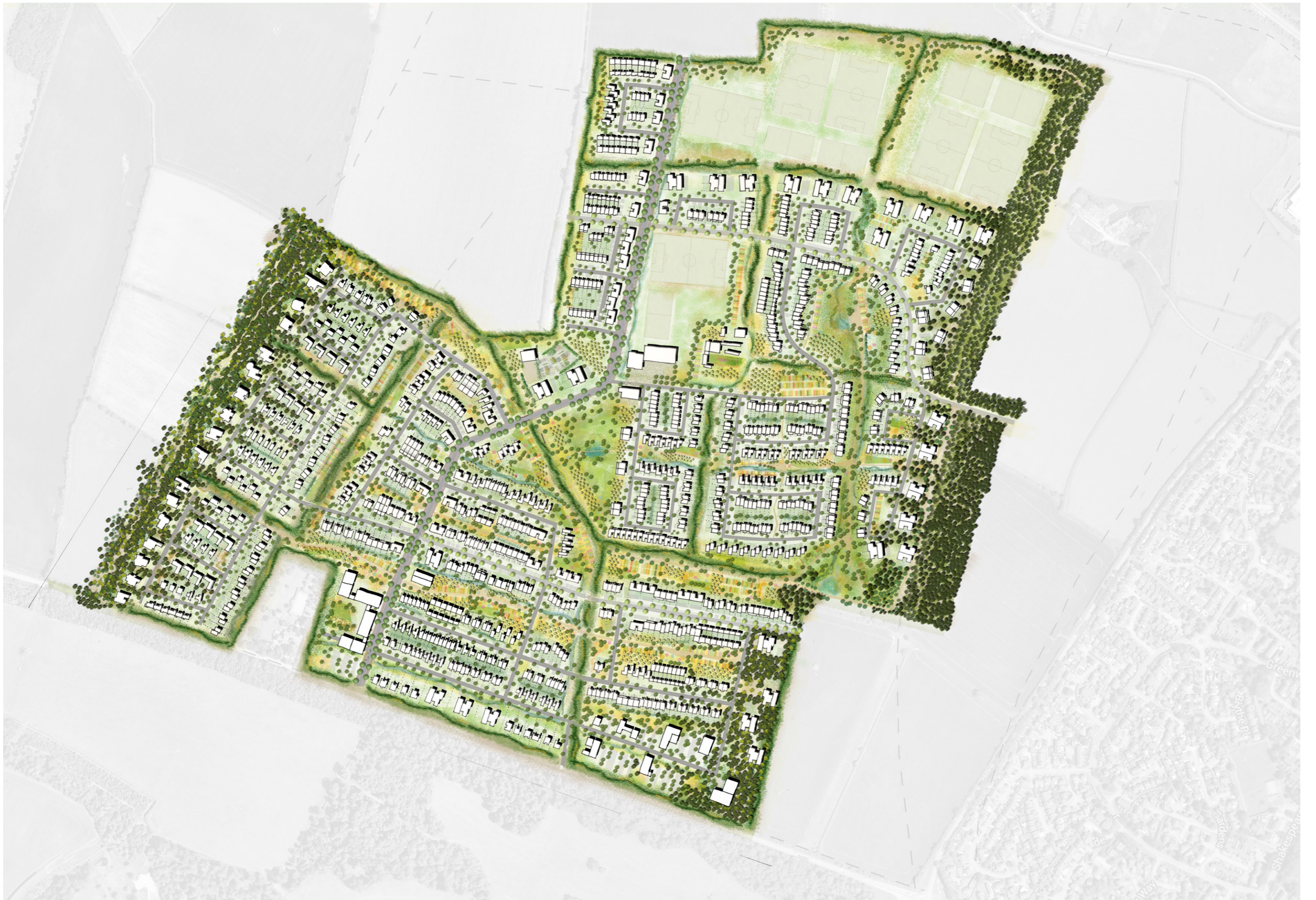
The Illustrative Masterplan