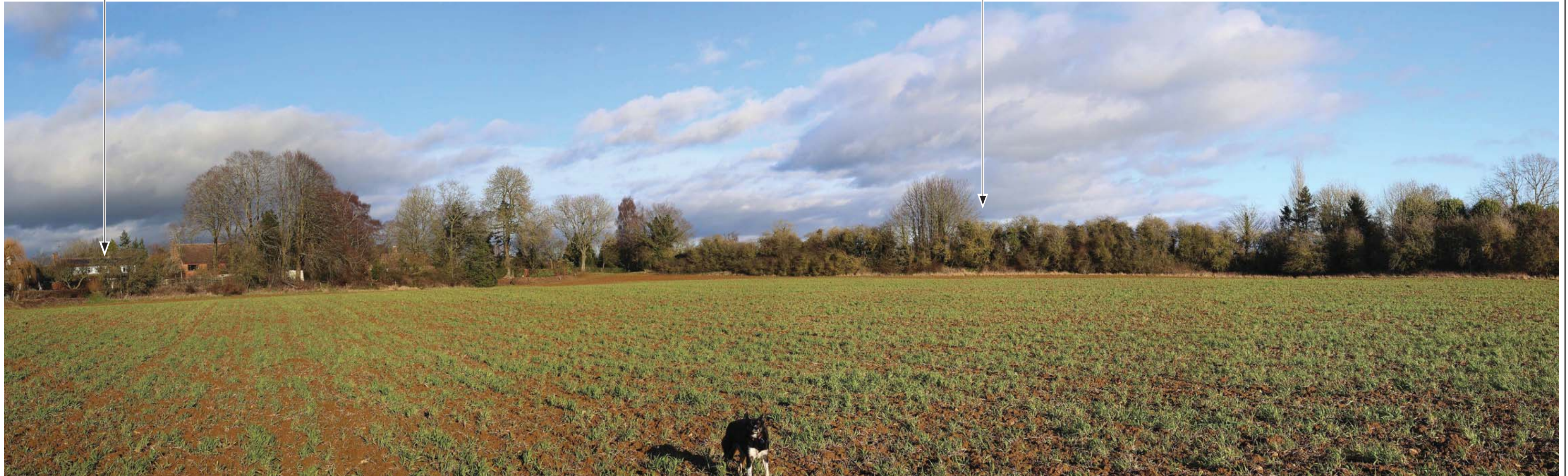
Viewpoint 15: From footpath 101/26, south of Adderbury, looking north-east

Site lies beyond field boundaries and roadside vegetation