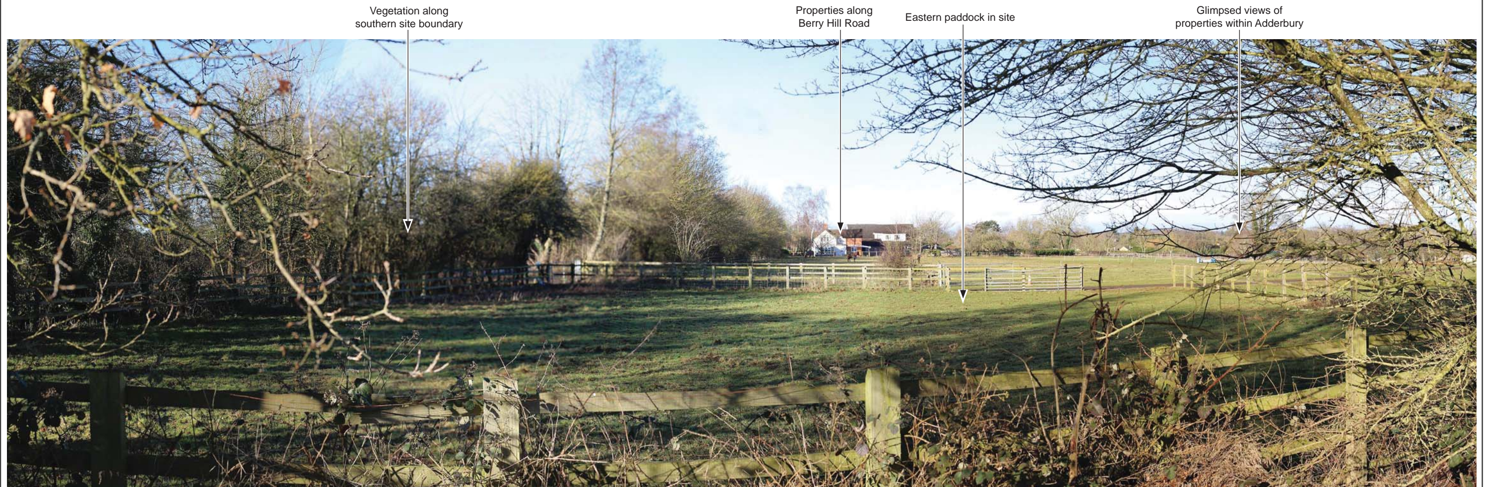
Viewpoint 4A: From public footpath 101/13 to the east of the site, looking west