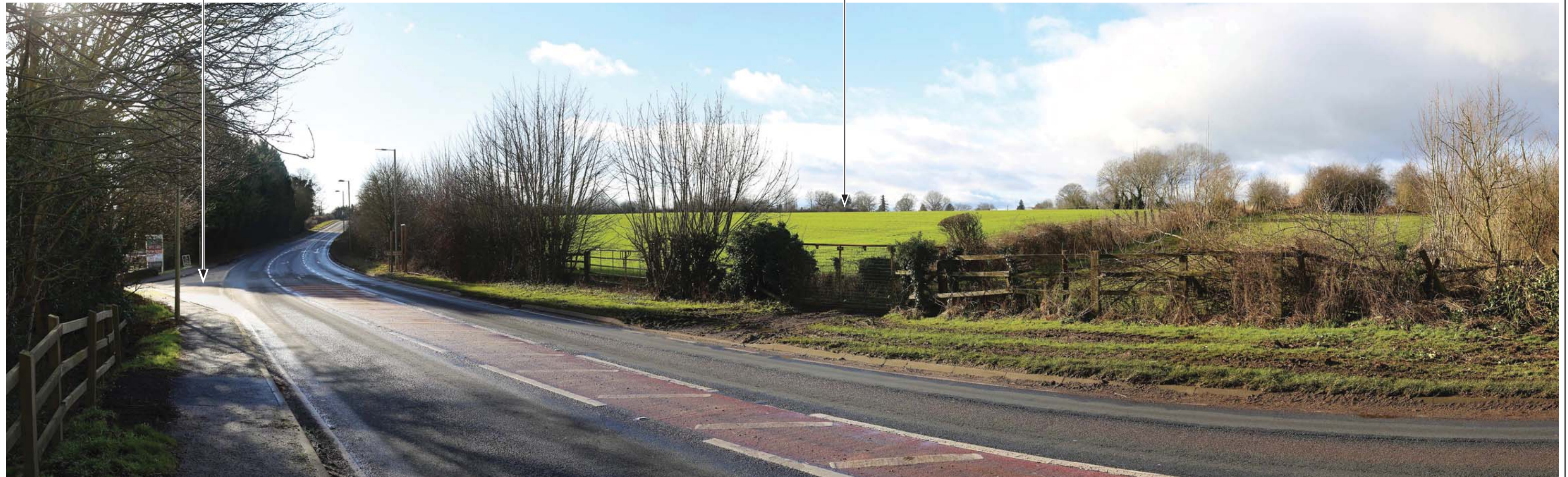
Viewpoint 14: From Oxford Road A4260 looking west towards site

Hedgerow along either side of footpath 101/13 - site lies beyond