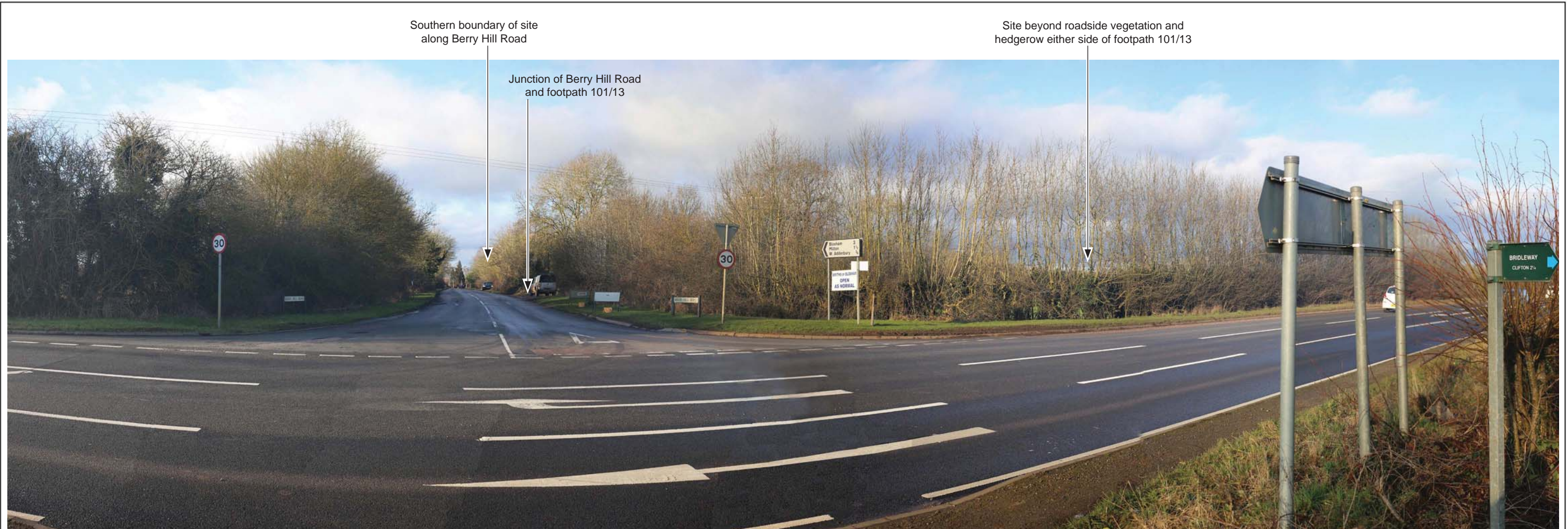
Viewpoint 11: From junction of bridleway 101/9 with A4260 Oxford Road looking north-west