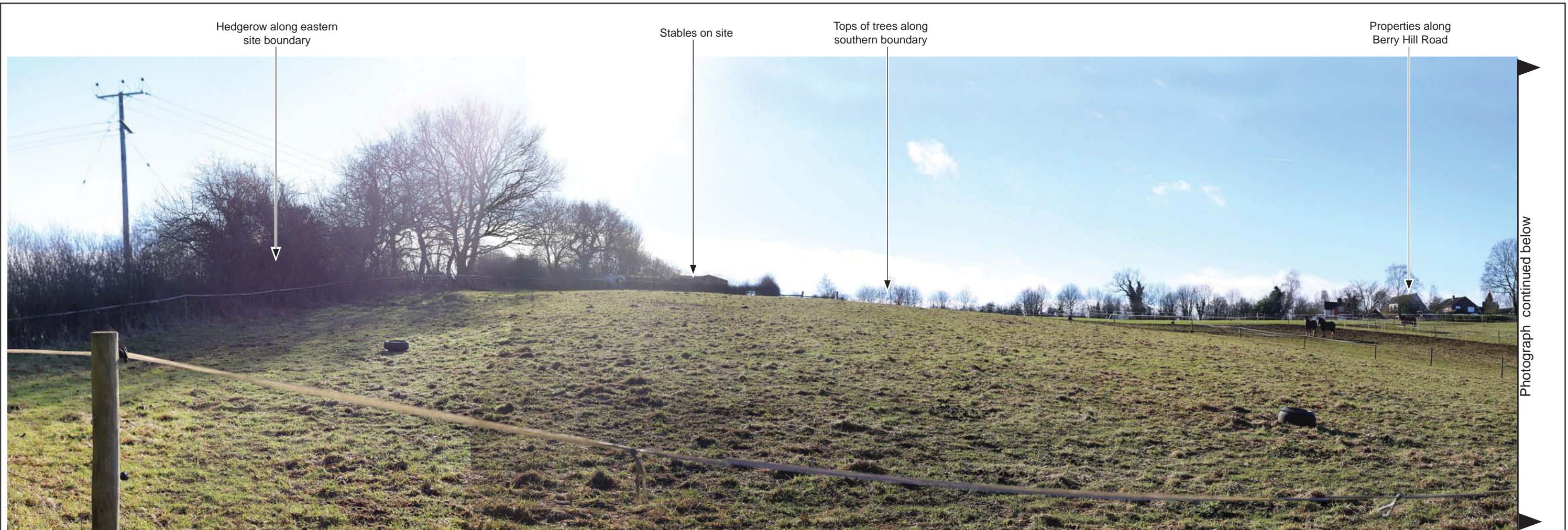
Viewpoint 5A: From public right of way 101/6 along northern boundary of the site, looking south