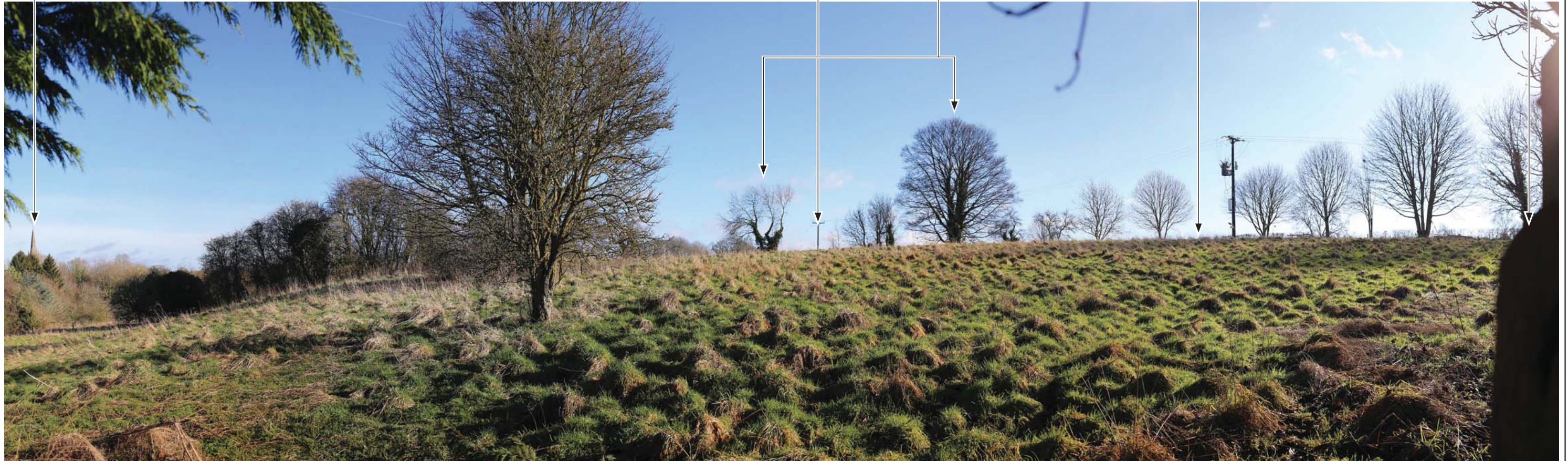
Viewpoint 7: From footpath 101/24 looking south-east

Close boarded fence along footpath 101/24