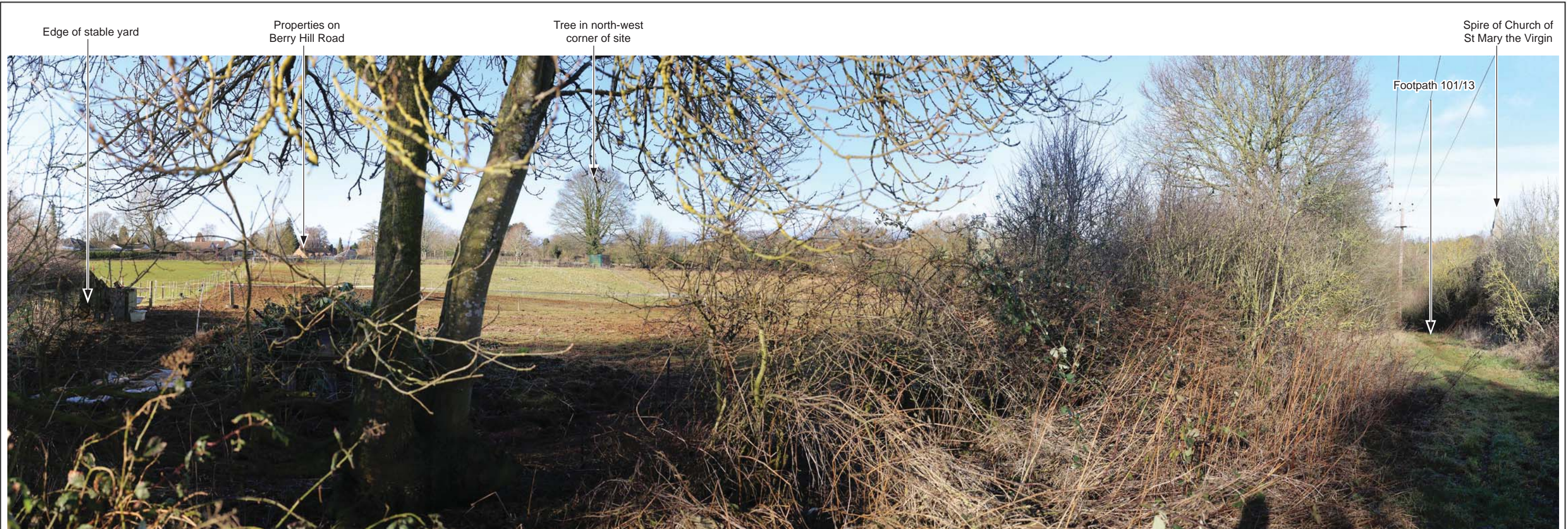
Viewpoint 8: From footpath 101/13 looking west across site