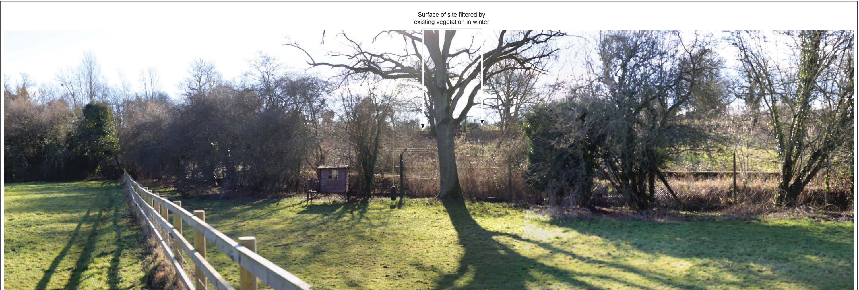
Viewpoint 12: From footpath 101/13 looking south