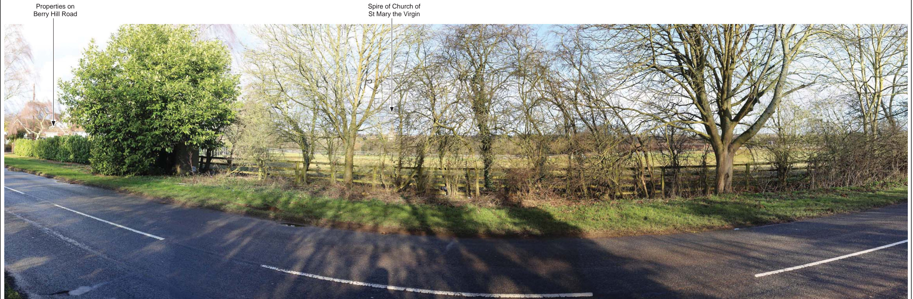
Viewpoint 9: From Berry Hill Road looking north-east