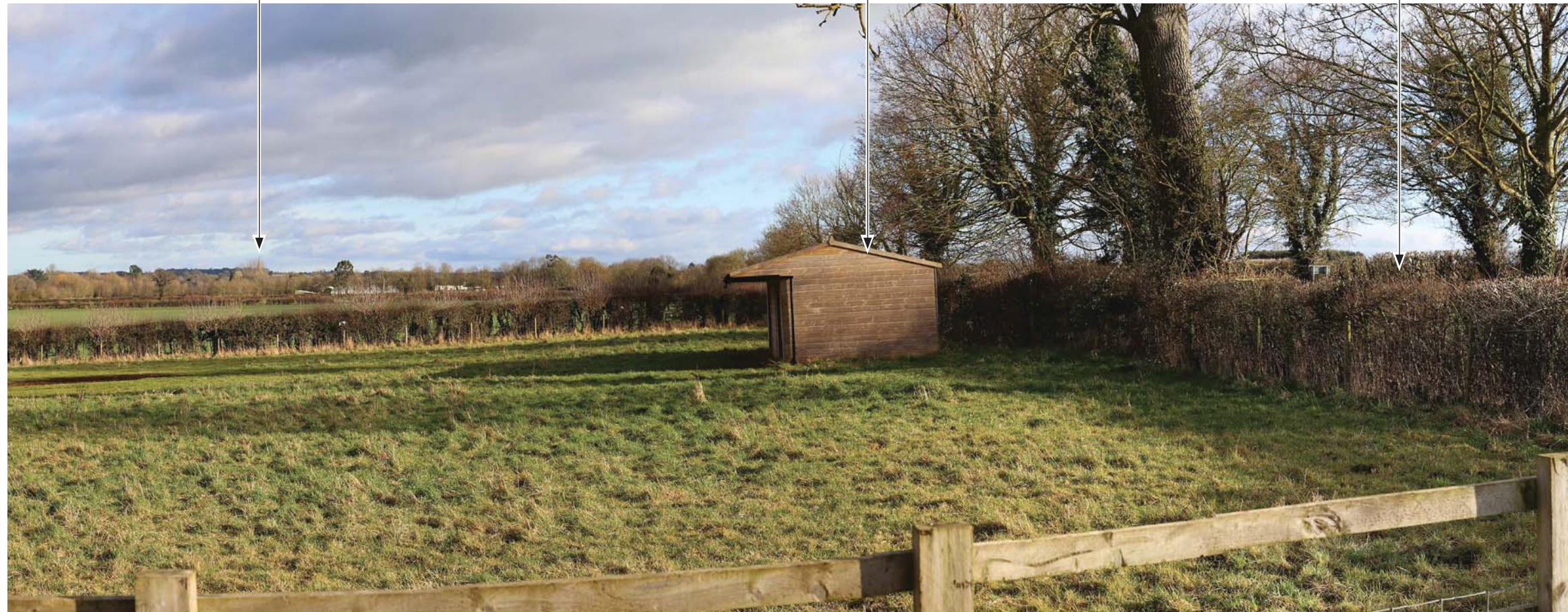
Viewpoint 16: From footpath 300/5, west of Adderbury, looking east