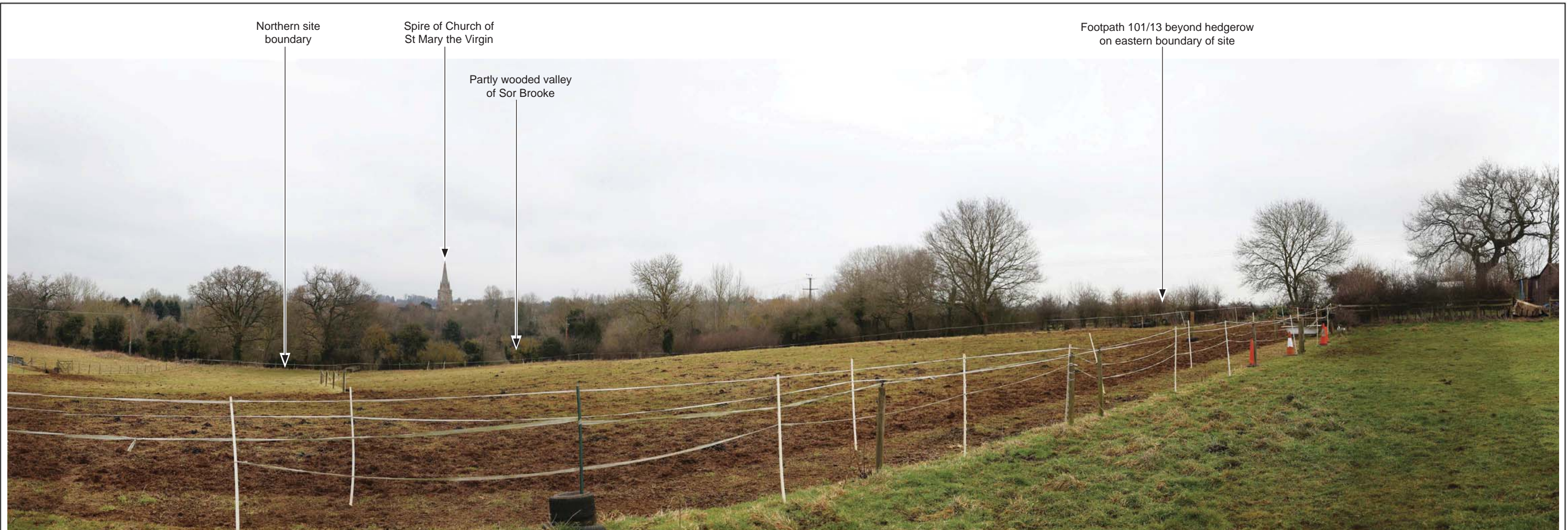
Viewpoint 10: From site looking north-east