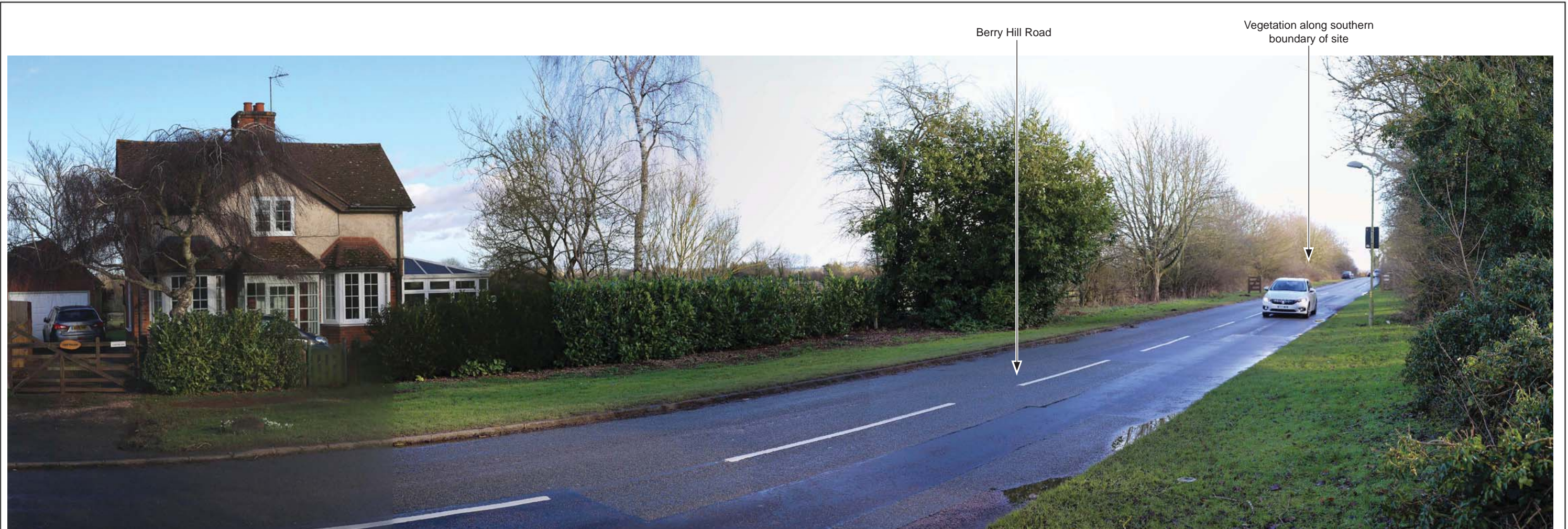
Viewpoint 6A: From Berry Hill Road, to west of the site, looking north-east