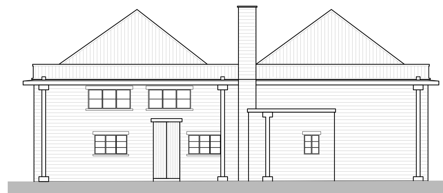
BUILDING 119 SOUTH ELEVATION - Proposed Parapet Cladding

This drawing is to be read in conjunction with the detail 12068 - DD(119)111: PARAPET DETAIL - PROPOSED CLADDING