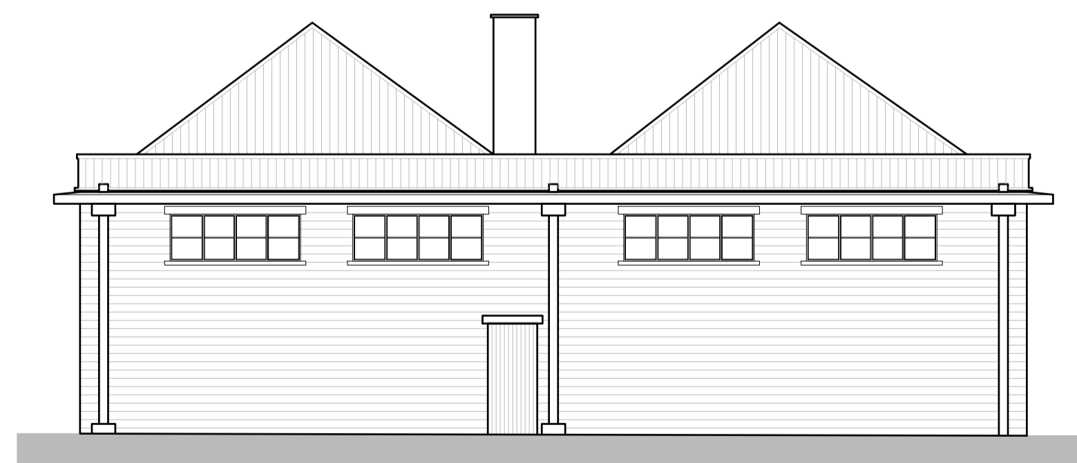
BUILDING 119 NORTH ELEVATION - Proposed Parapet Cladding