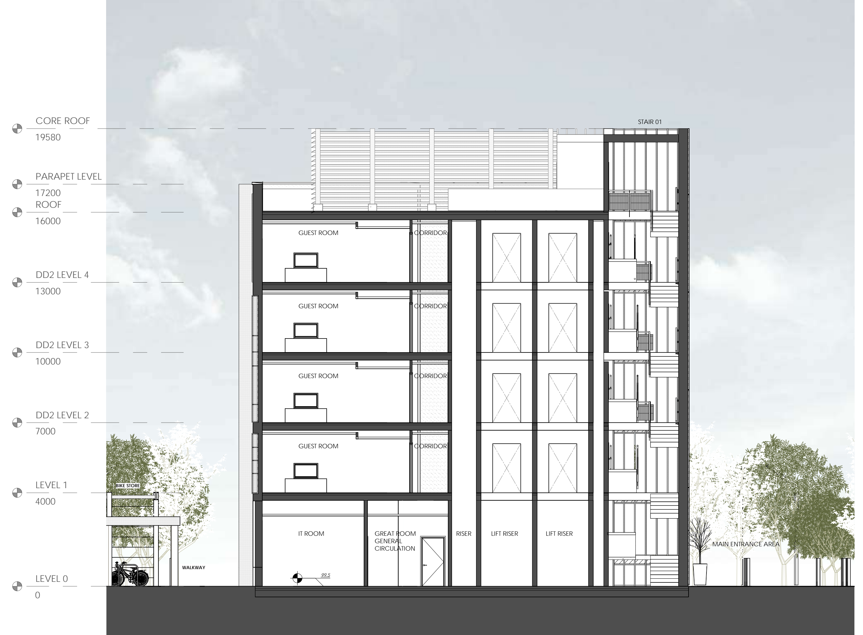
02 SHORT SECTION 02 1 : 100 @ A1