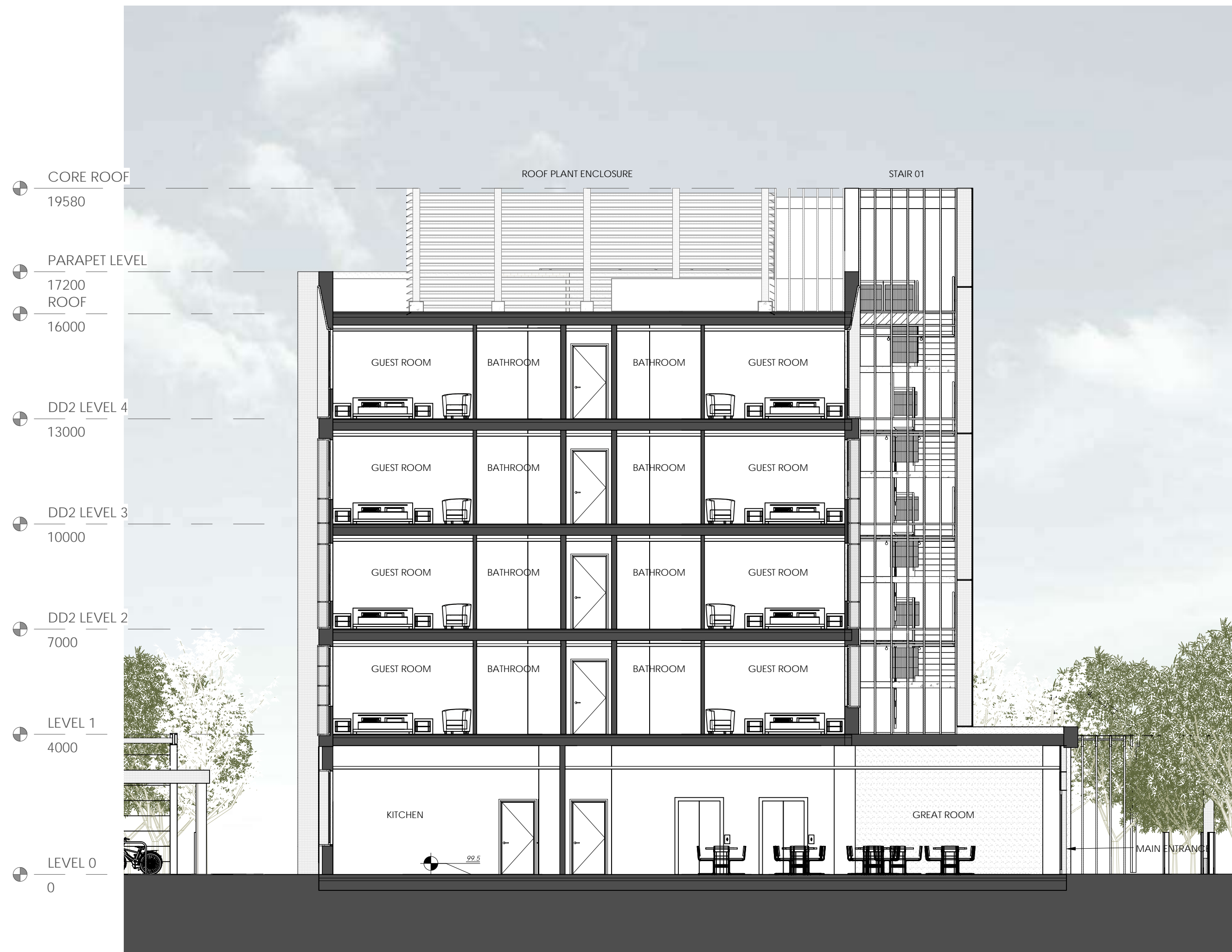
01 SHORT SECTION 01 1 : 100 @ A1