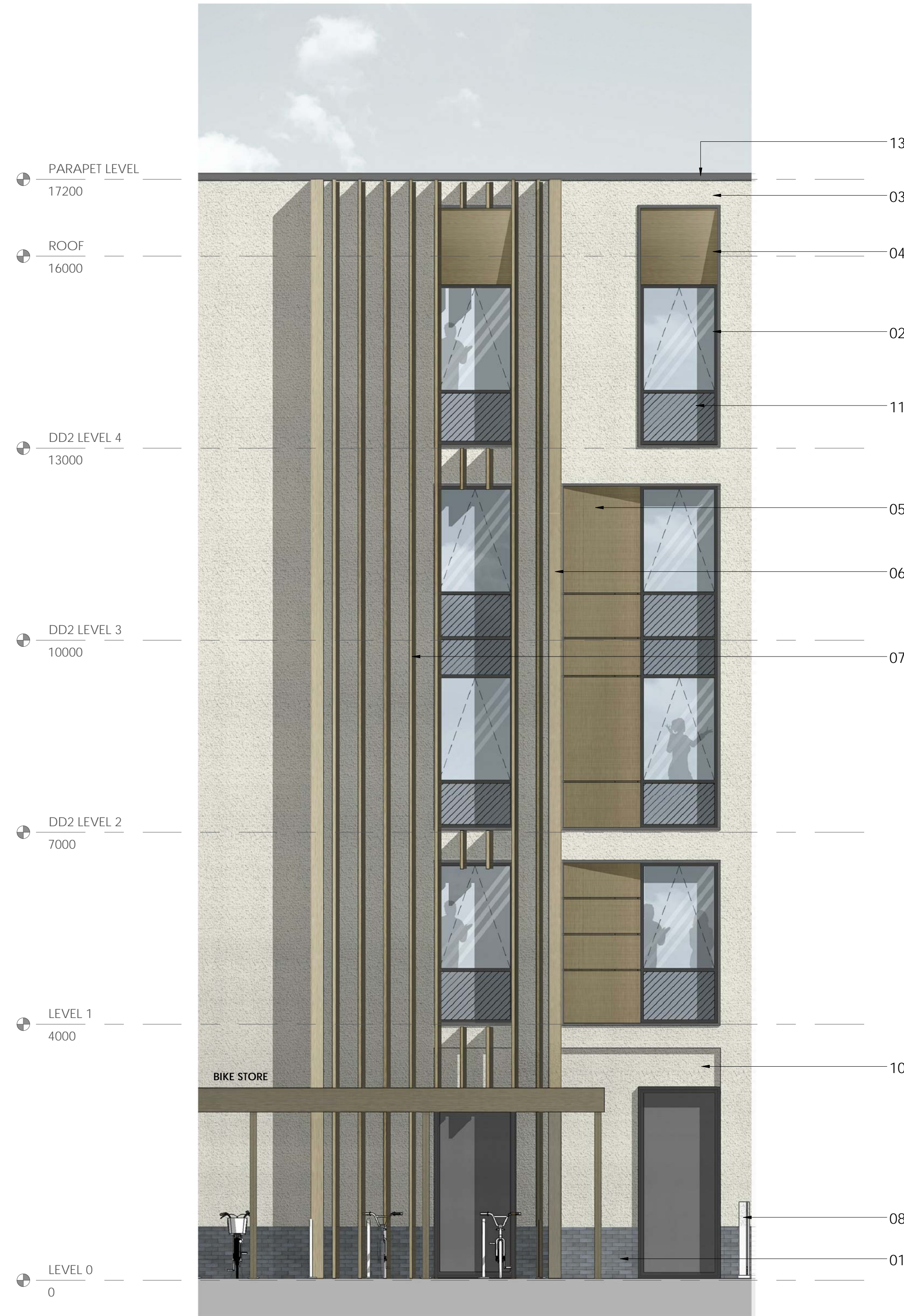
02 TYPICAL BAY A - ELEVATION 1: 50 @ A1