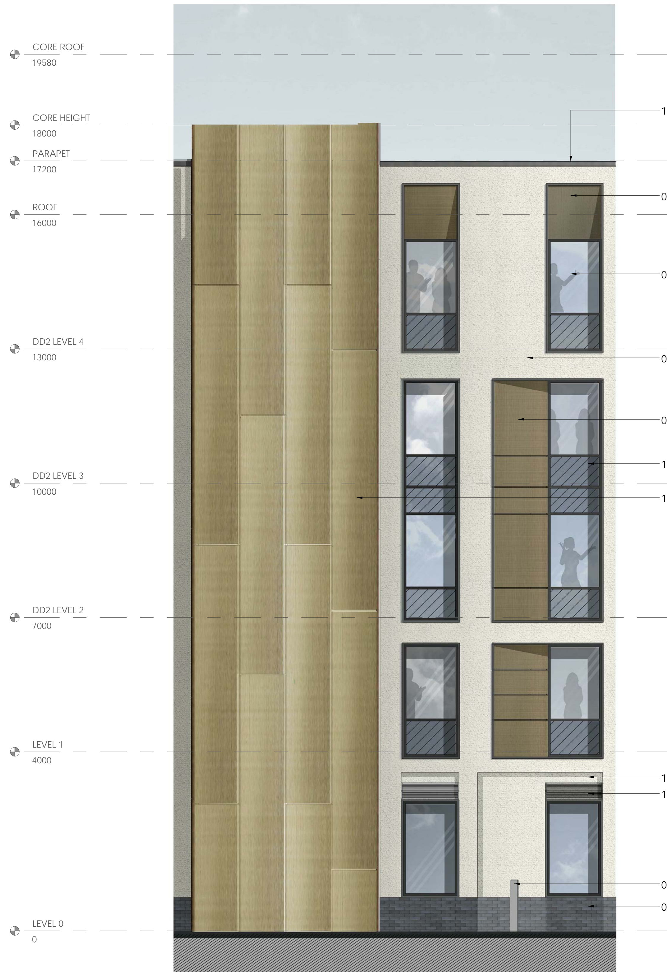
02 TYPICAL BAY B - ELEVATION 1 : 50 @ A1