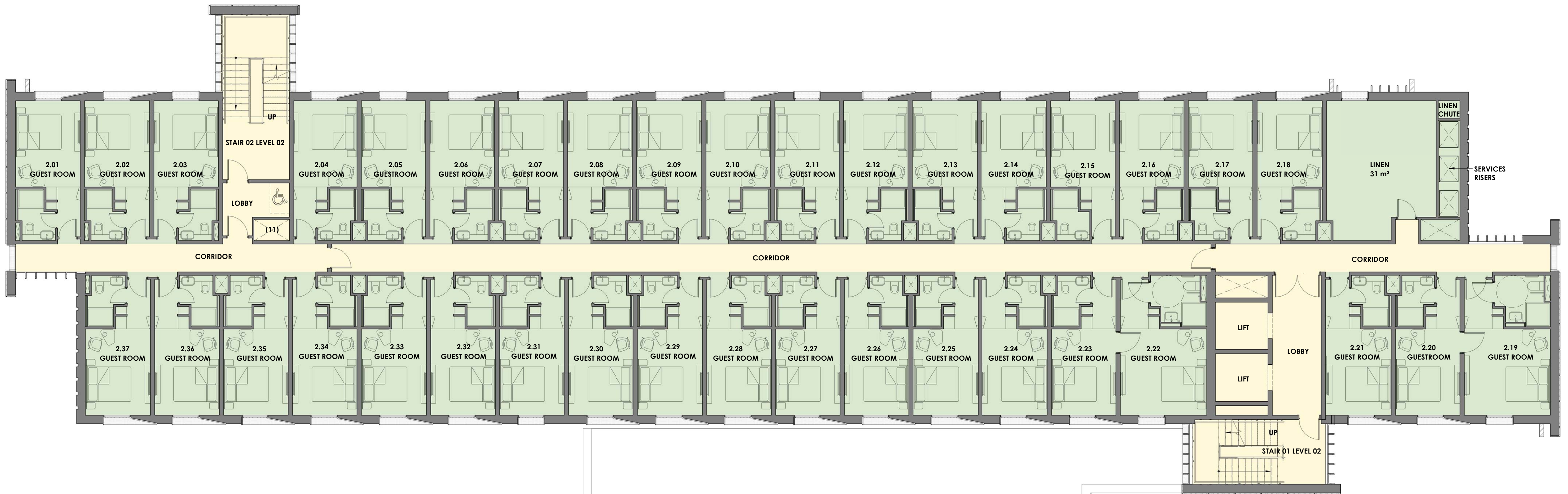
TYPICAL FLOOR PLAN [2-4TH]