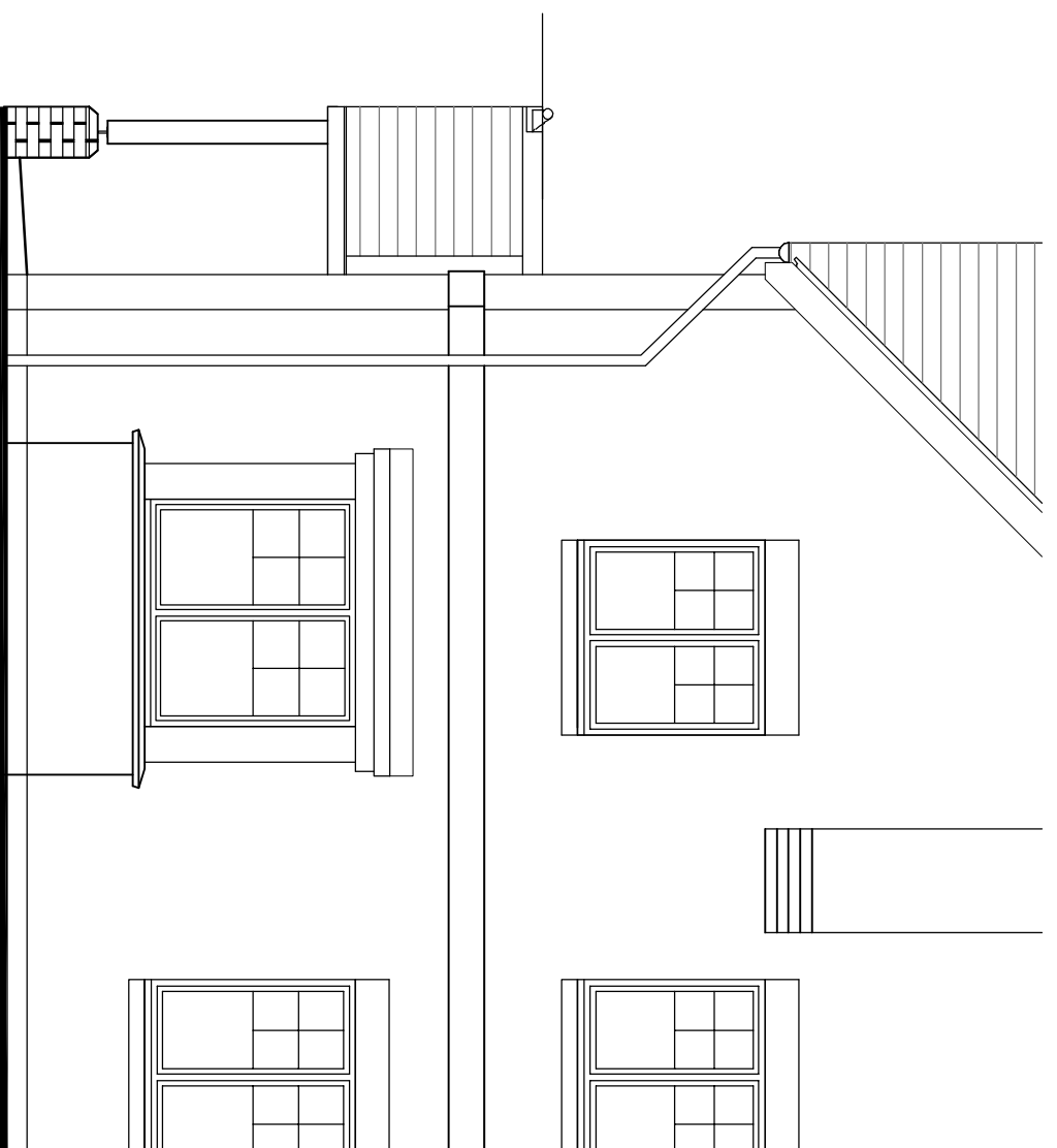
Side Elevation (Scale 1:50)