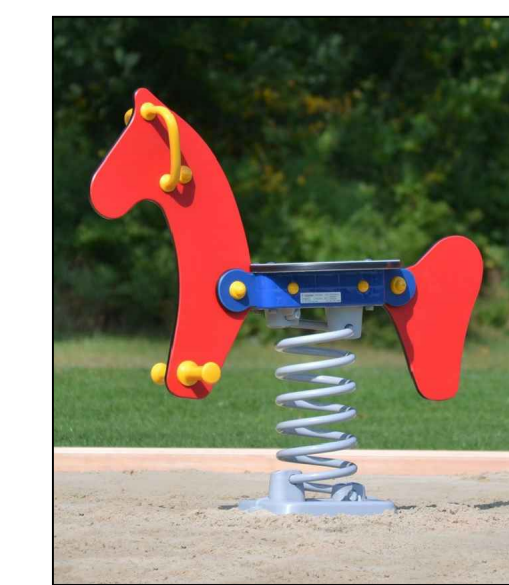
7. Spring Horse by Playdale