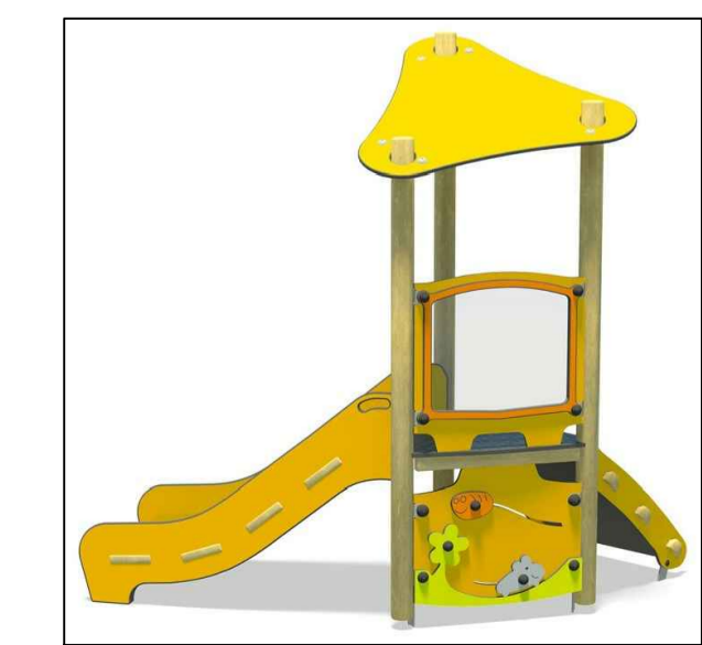
8. Discover by Playdale