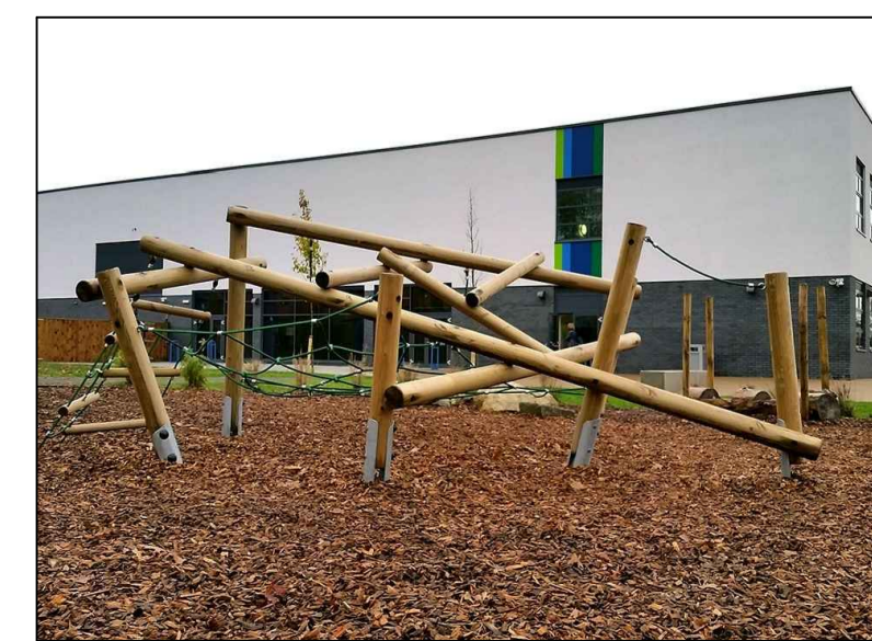
1. Chimpanzee by Playdale

Location Plan Not to Scale LIZ LAKE ASSOCIATES LANDSCAPE ARCHITECTS