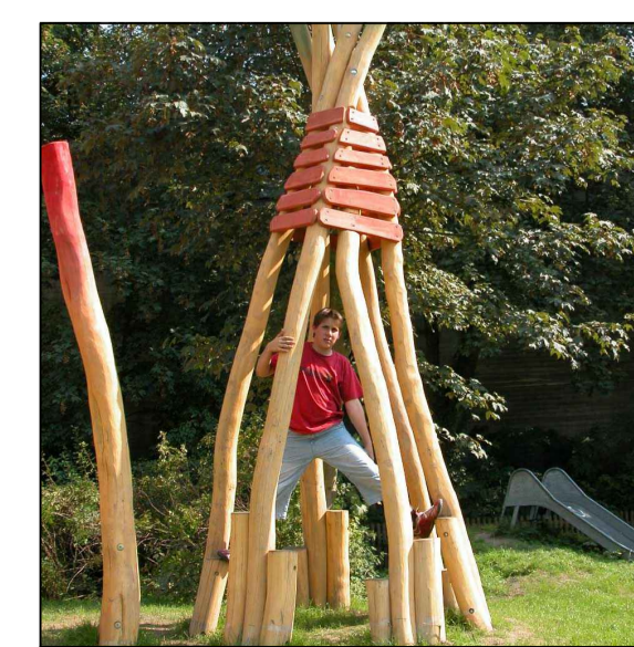
4. Teepee Little Course by Jupiter Play