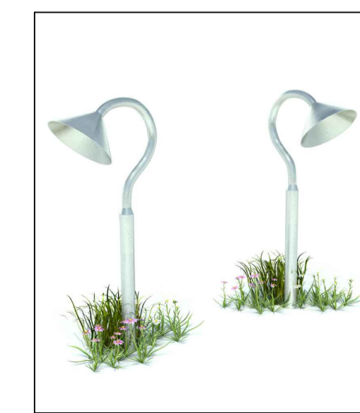
6. Talk Tubes by Jupiter Play