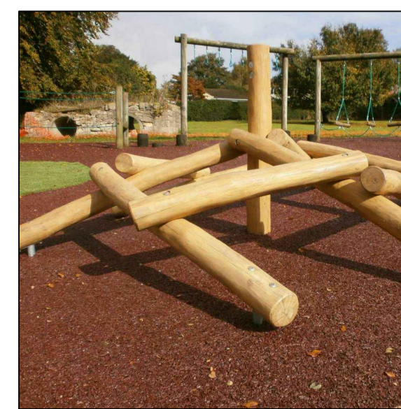
3. Trunk Pile by Jupiter Play