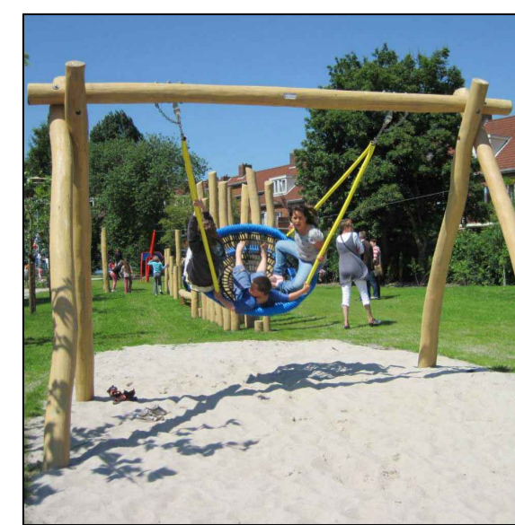
2. Nest Swing 2.6m by Jupiter Play