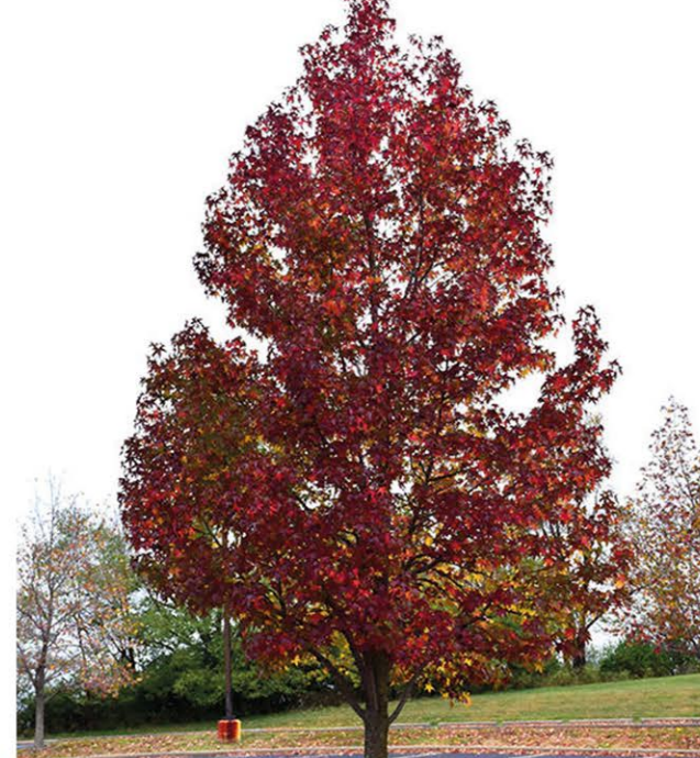
Specimen Trees (e.g. Liquidambar styraciflua )