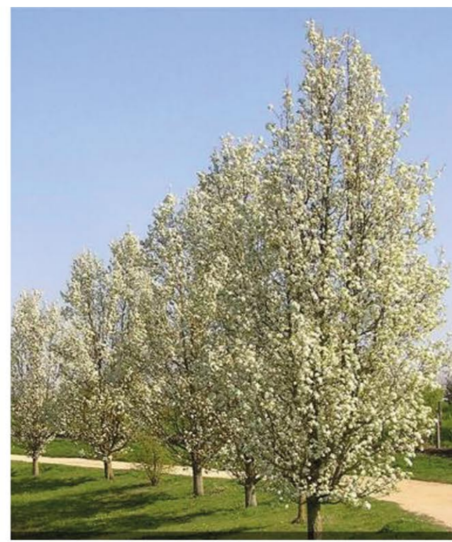
Street Trees (e.g. Pyrus calleryana 'Chanticleer')