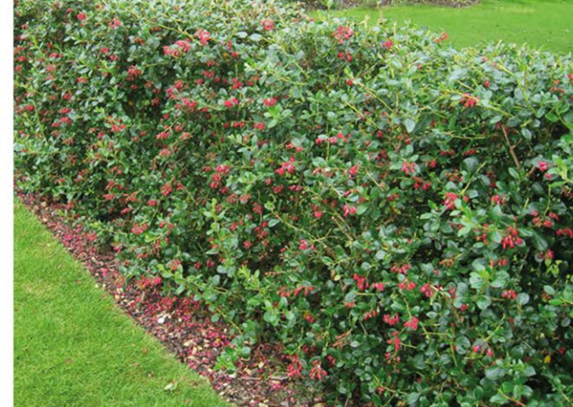
Evergreen hedges (e.g. Escallonia 'Donard Seedling')