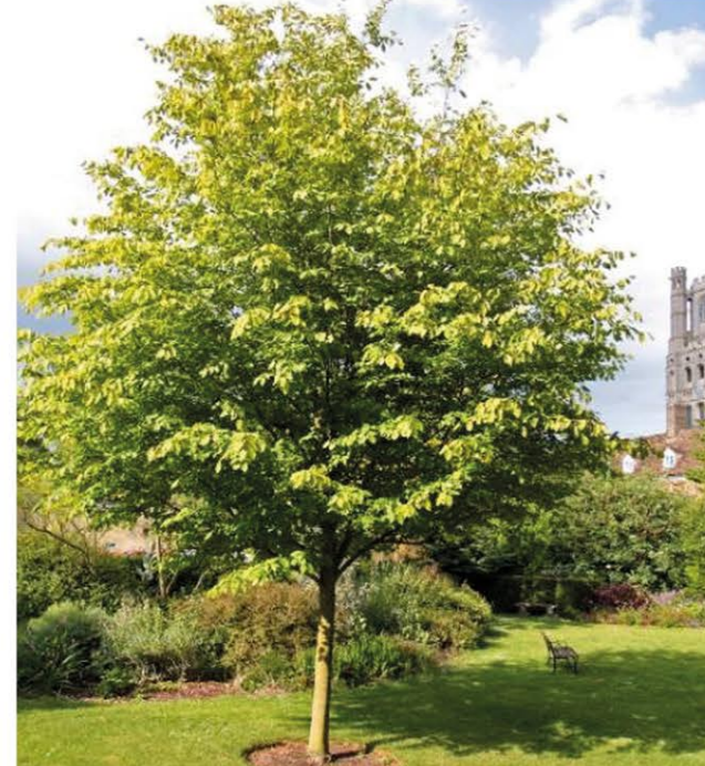
Street Trees (e.g. Amelanchier 'Robin Hill')