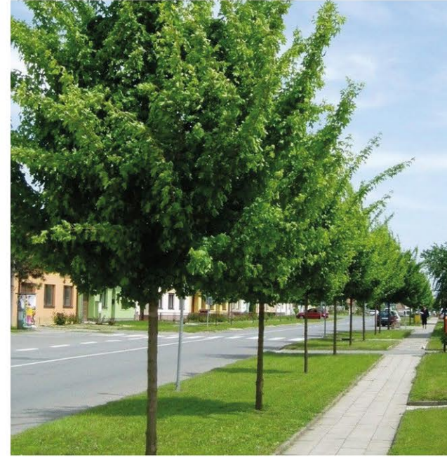
Street Trees (e.g. Acer campestre 'Elsrijk')