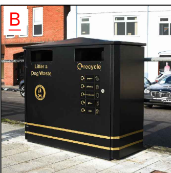
B BX45 2552-DD-RC - Derby Double Wheelie Bin