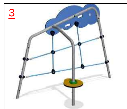
3 MSC5401 - CLOUD CLIMBER BY KOMPAN