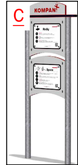
C M213 - KOMPAN Sign for 3 descriptions