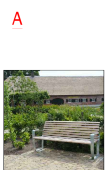
A BX14 4015 - Willenhall seat