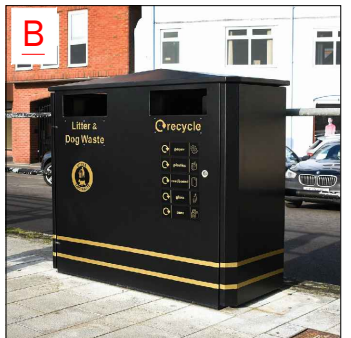
B BX45 2552-DD-RC - Derby Double Wheelie Bin