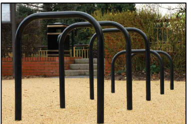
BXMW/GS/Sheffield-stand - Sheffield Cycle Stand