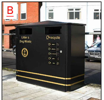
B BX45 2552-DD-RC - Derby Double Wheelie Bin