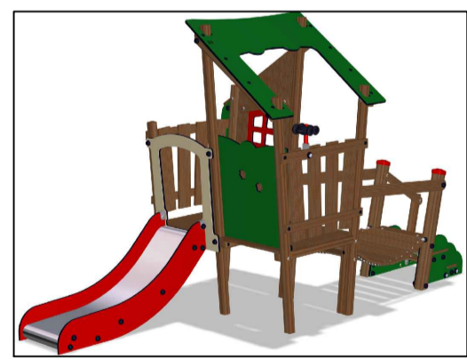
NAT506 - TREE CASTLE BY KOMPAN