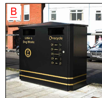
BX45 2552-DD-RC - Derby Double Wheelie Bin