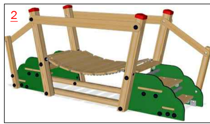
GSP0005 - PEEKABOO TUNNEL BY KOMPAN