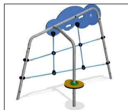
MSC5401 - CLOUD CLIMBER BY KOMPAN