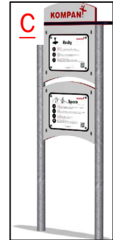
M213 - KOMPAN Sign for 3 descriptions