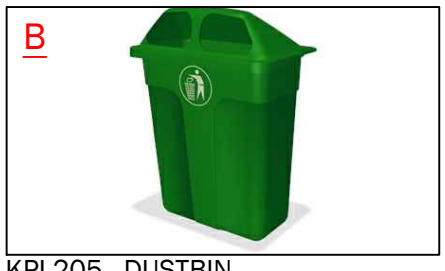
B KPL205 - DUSTBIN