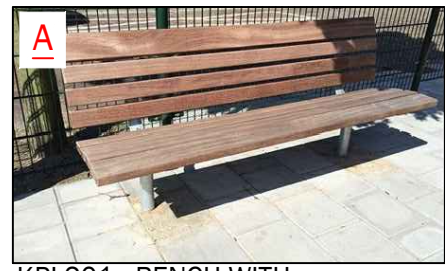
A KPL201 - BENCH WITH BACKREST, PINE