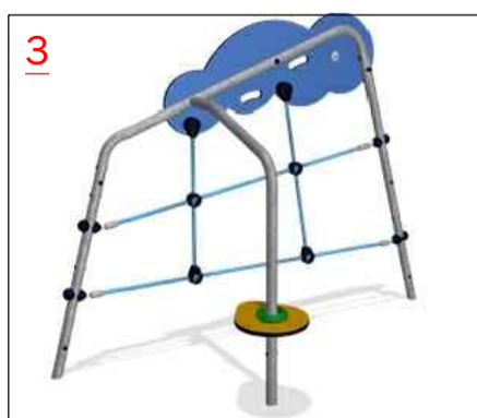
3 MSC5401 - CLOUD CLIMBER BY KOMPAN