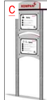
C M213 - KOMPAN Sign for 3 descriptions