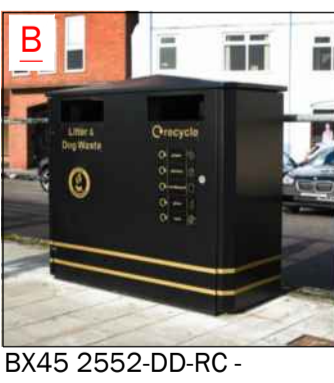
B BX45 2552-DD-RC - Derby Double Wheelie Bin