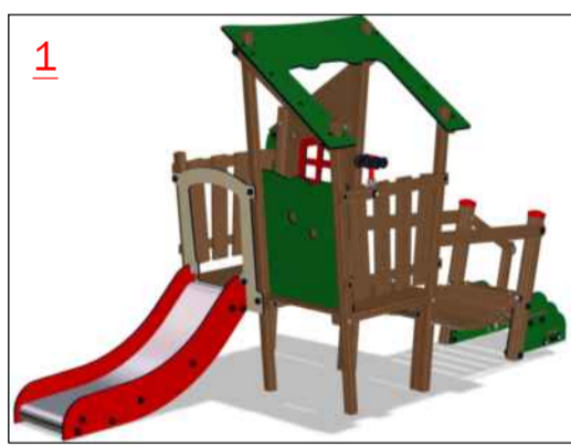
1 NAT506 - TREE CASTLE BY KOMPAN