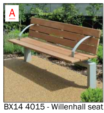
A BX14 4015 - Willenhall seat