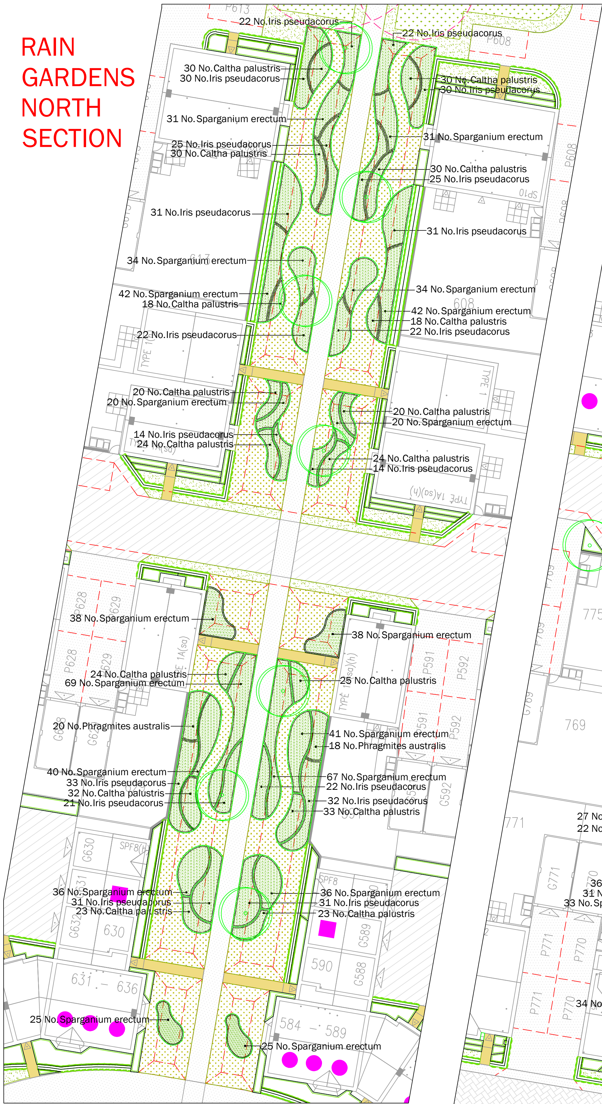
RAIN GARDEN PLANTING SCHEDULE