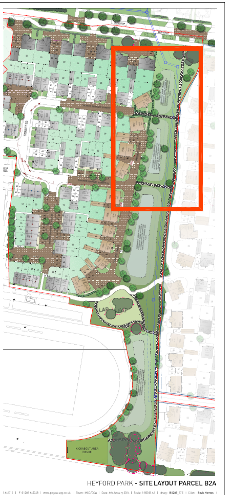
HEYFORD PARK - SITE LAYOUT PARCEL B2A

Extract of Approved drawing no. B.0285_57E (Site Layout Parcel B2b)