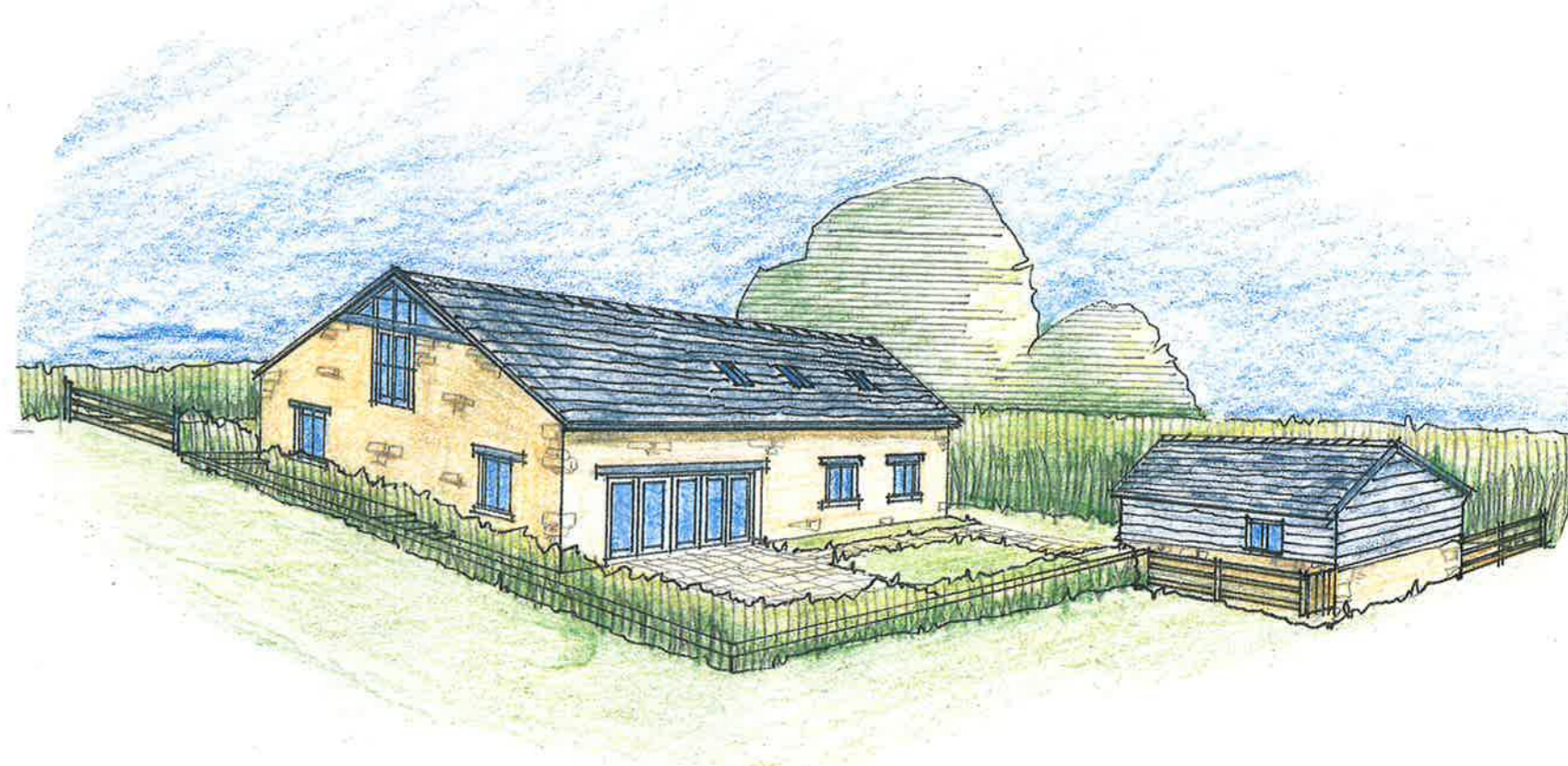
SKETCH FROM THE SOUTH (NTS)