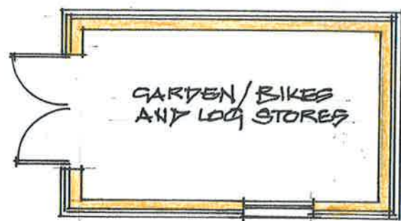
FLOOR PLAN 1:100