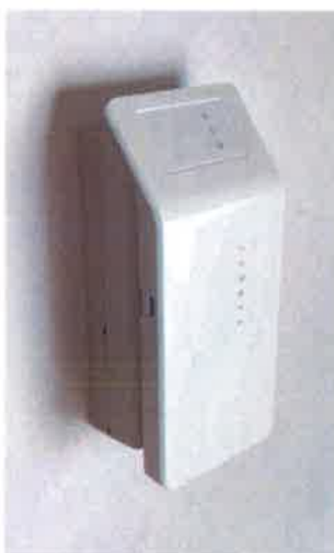
ONT – Customer Premise Broadband/Telephony Device

A single fibre core connects to the Optical Network Terminal (ONT) within each property which allows high speed broadband (up to 1Gbps) and Voice over IP (VoIP) telephony services to be delivered through 4 fixed network ports, 2 telephone ports and wireless. The fixed network ports can be connected directly into the home's structured wiring scheme and the wireless is made available as a conventional home router connection.