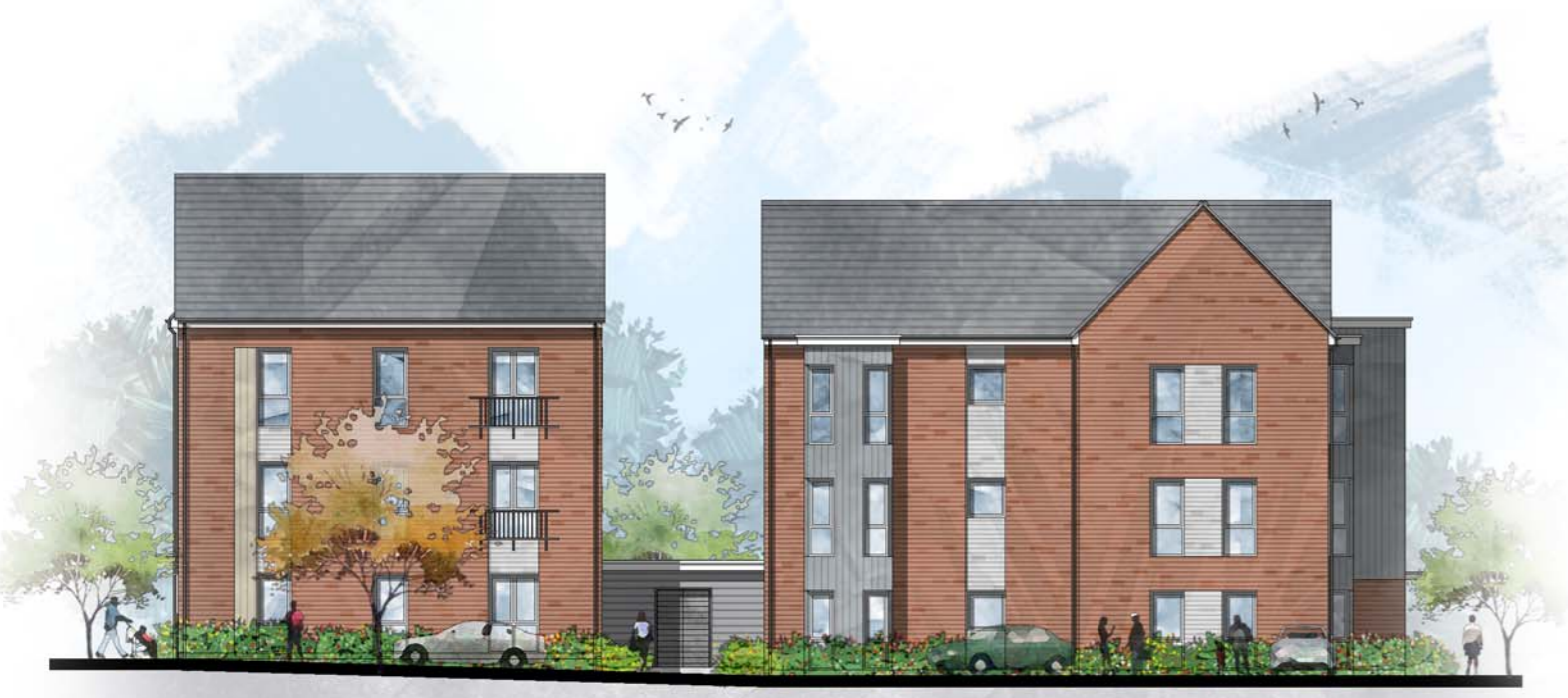
PLOT 434-439 PLOT 410-418

REVISIONS: A. 2016-03-08. Minor landscaping amendments, garage added to plot 409 and hatching added to existing buildings at clients request. Street scenes updated to reflect changes to the house types. PVA