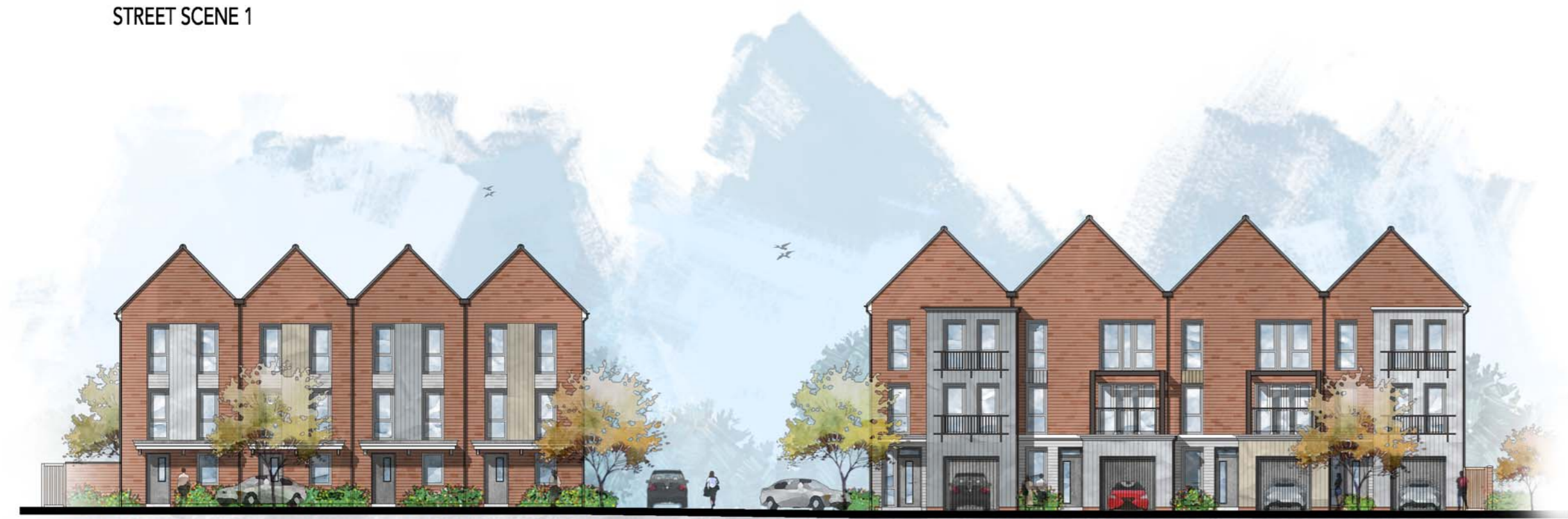
PLOT 374 PLOT 375 PLOT 376 PLOT 377 PLOT 408 PLOT 407 PLOT 406 PLOT 405