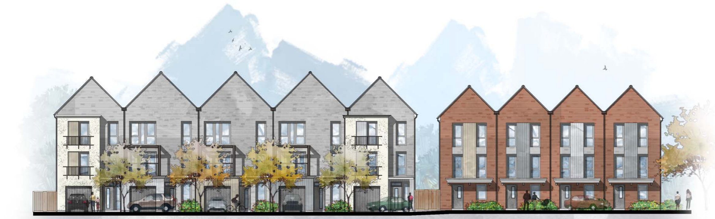
PLOT 365 PLOT 366 PLOT 367 PLOT 368 PLOT 369 PLOT 370 PLOT 371 PLOT 372 PLOT 373