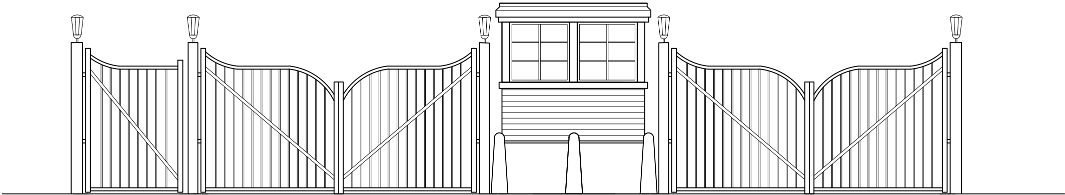
Proposed West Elevation - Gate House Kiosk