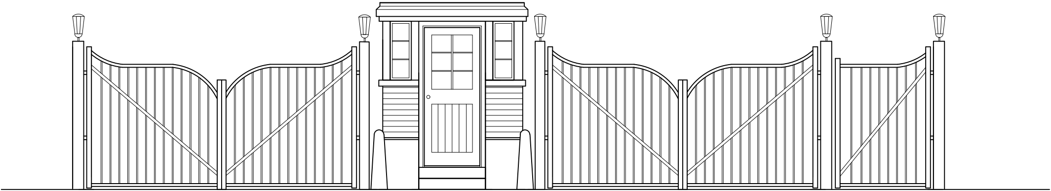
Proposed East Elevation - Gate House Kiosk