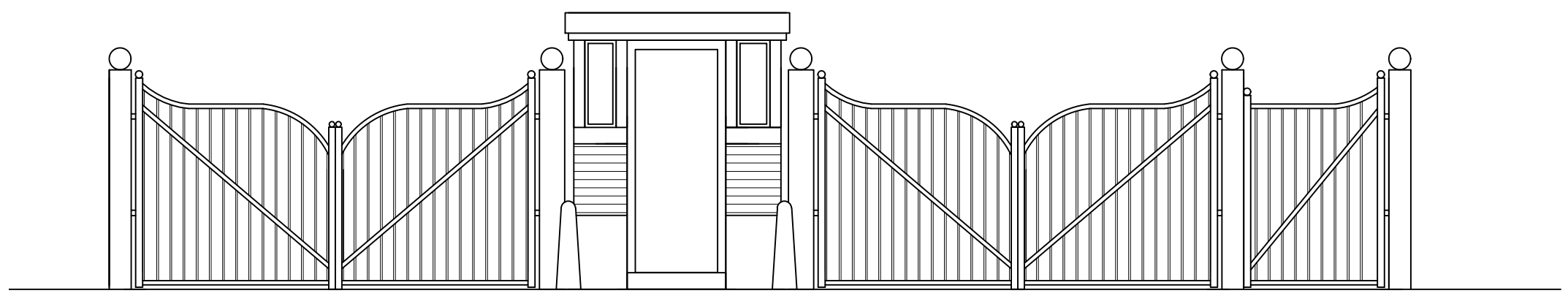
Proposed East Elevation – Gate House Kiosk