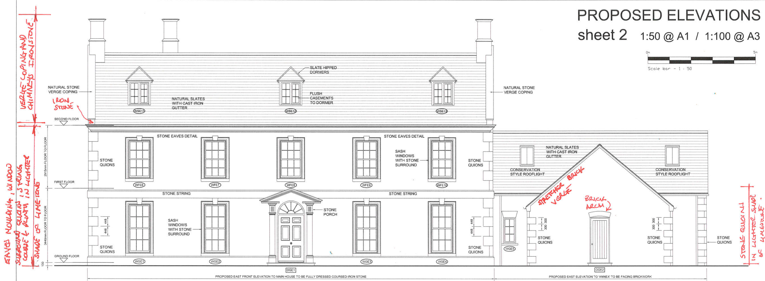
PROPOSED EAST (FRONT) ELEVATION 1:50