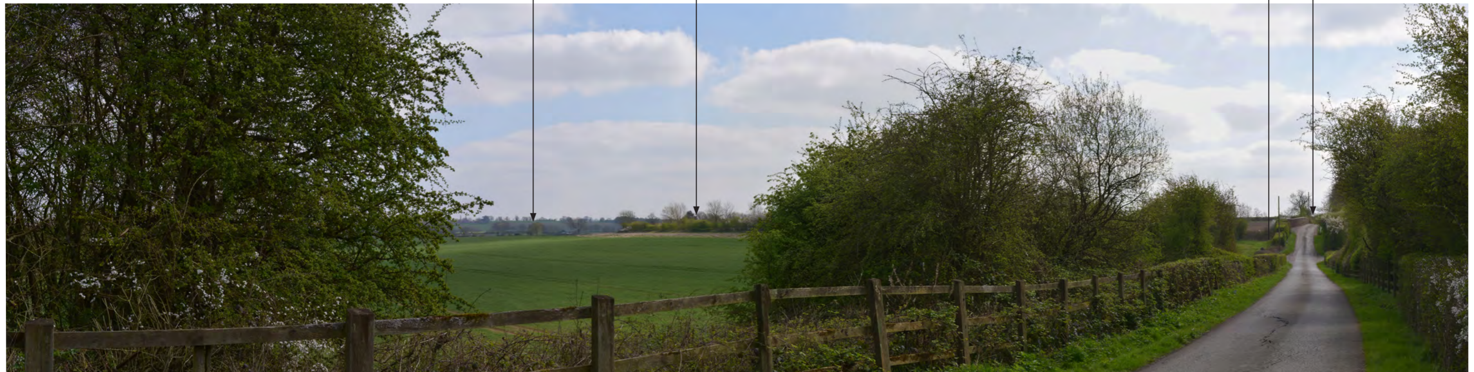
View south-east from Boddington Road - Viewpoint 4