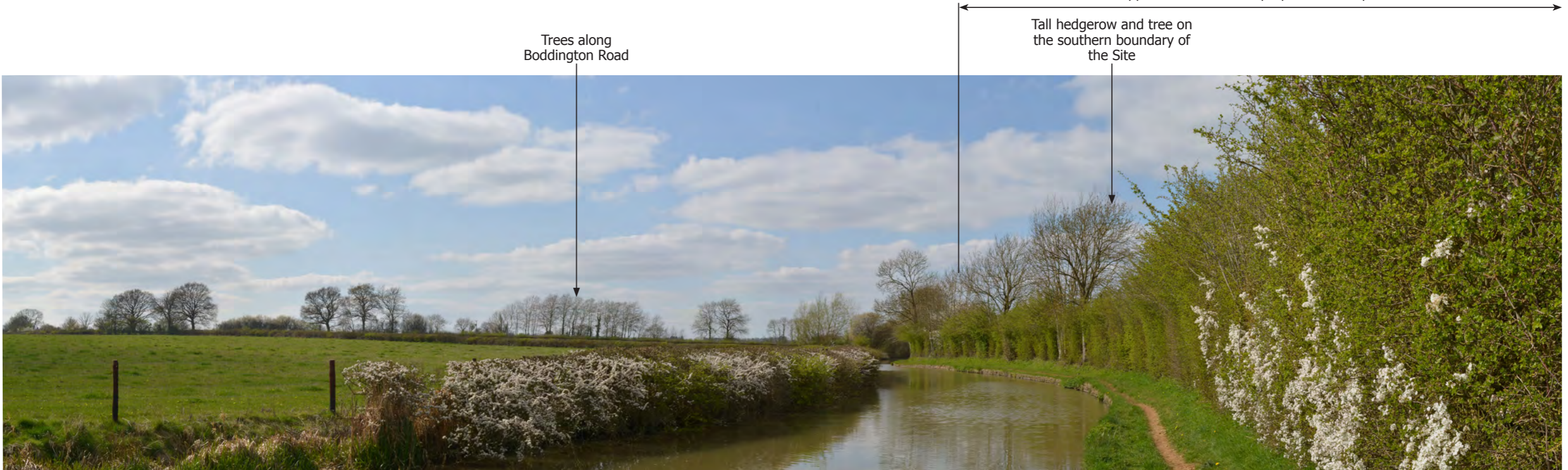
View west from Public Footpath 170/6 and Oxford Canal towpath - Viewpoint 2

Approximate extent of proposed development