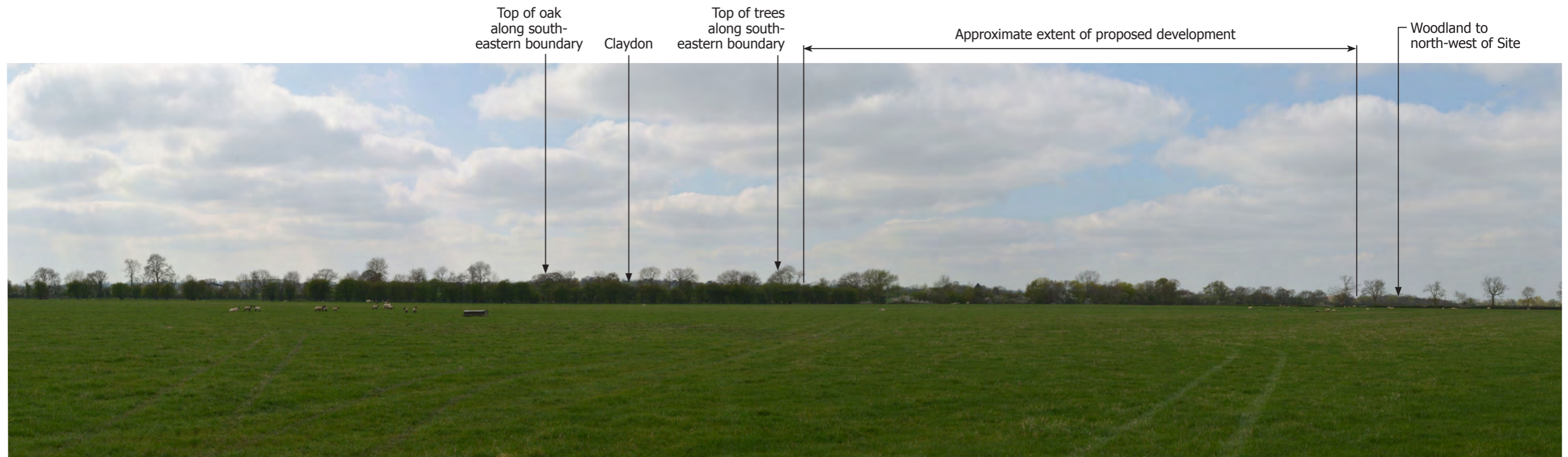
View south-west from Public Footpath AC1 - Viewpoint 6