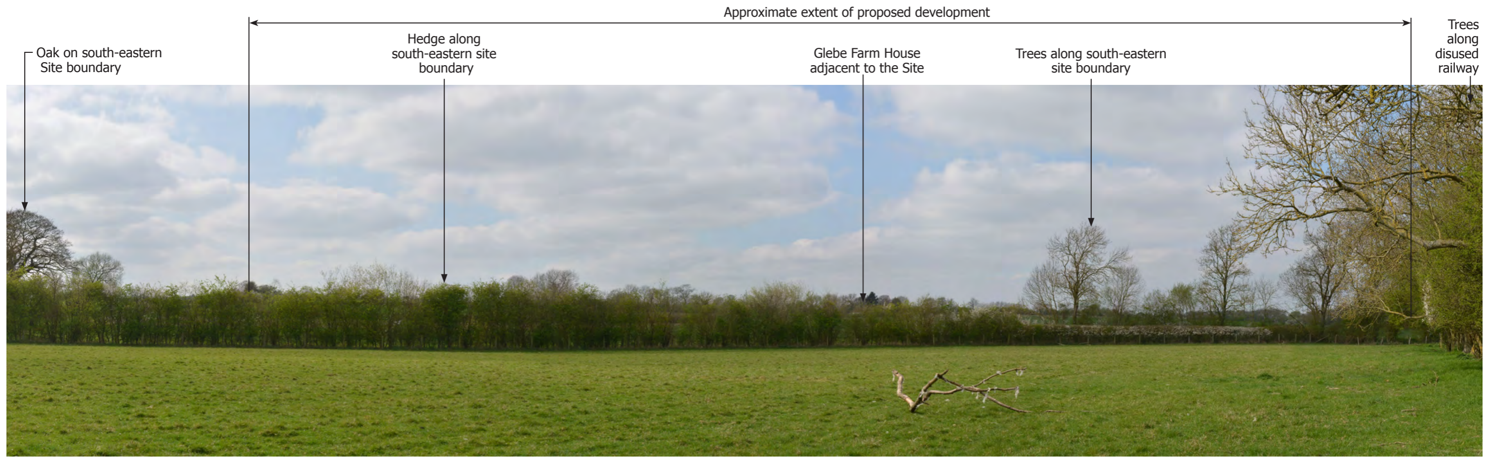
View west from Public Footpath AC1 - Viewpoint 5