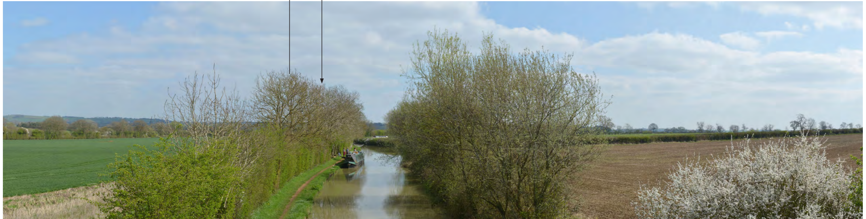
View north-east from Boddington Road Hay Bridge over Oxford Canal - Viewpoint 3

Hedgerow and trees along southern Site boundary