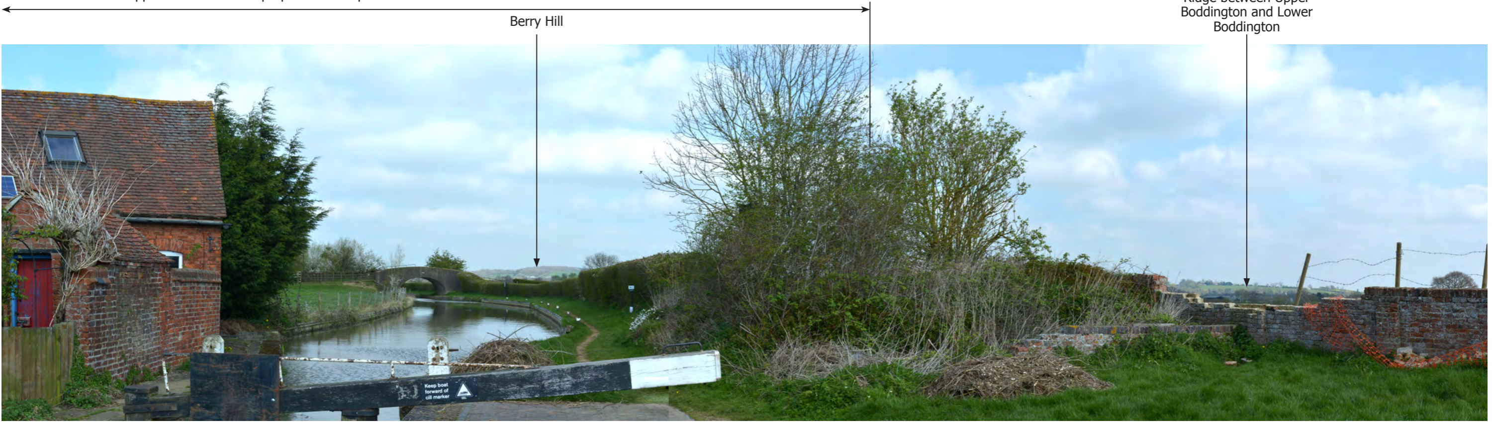
View north from Clayton Toplock (17) on the Oxford Canal towpath - Viewpoint 1

Approximate extent of proposed development