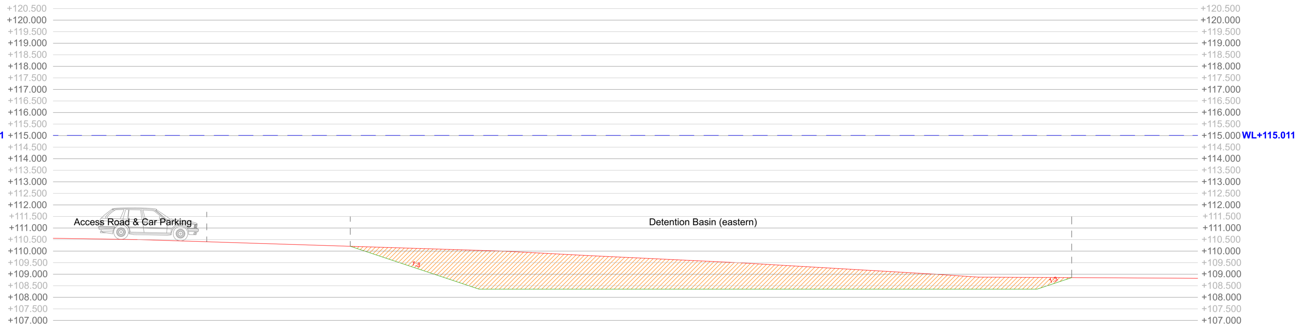
PROPOSED EASTERN DETENTION BASIN TYPICAL SECTION Scale 1:100