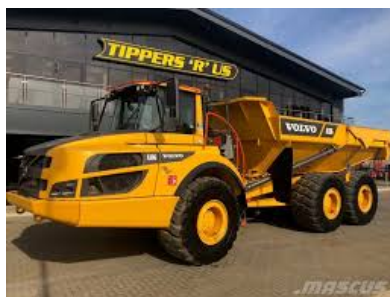
30 Tonne Dumper