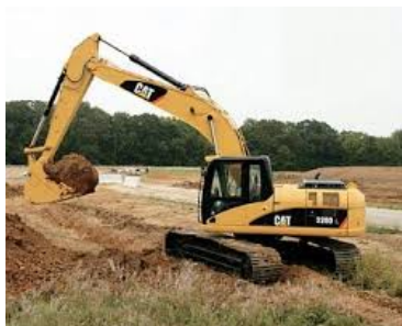
20 Tonne Excavator