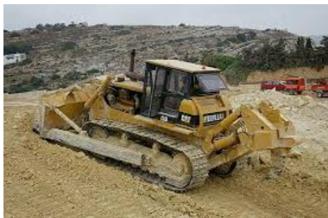
Caterpillar D8 Doser