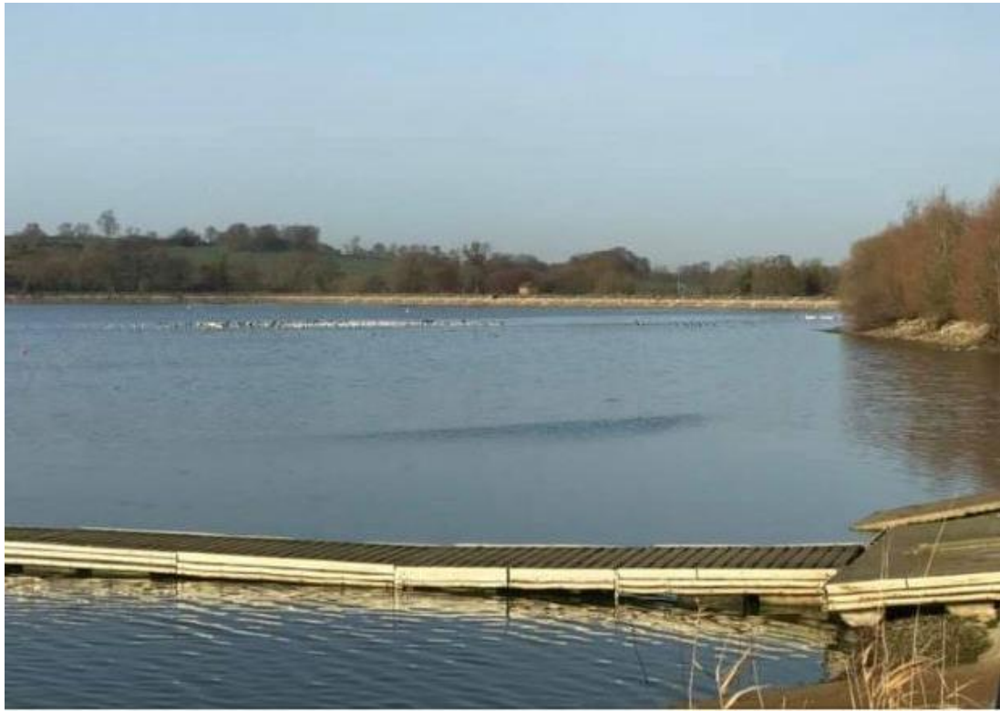
11 th December 2018: Photo of northern half of reservoir showing water level not recovered and shallows in middle evidenced by birds standing.