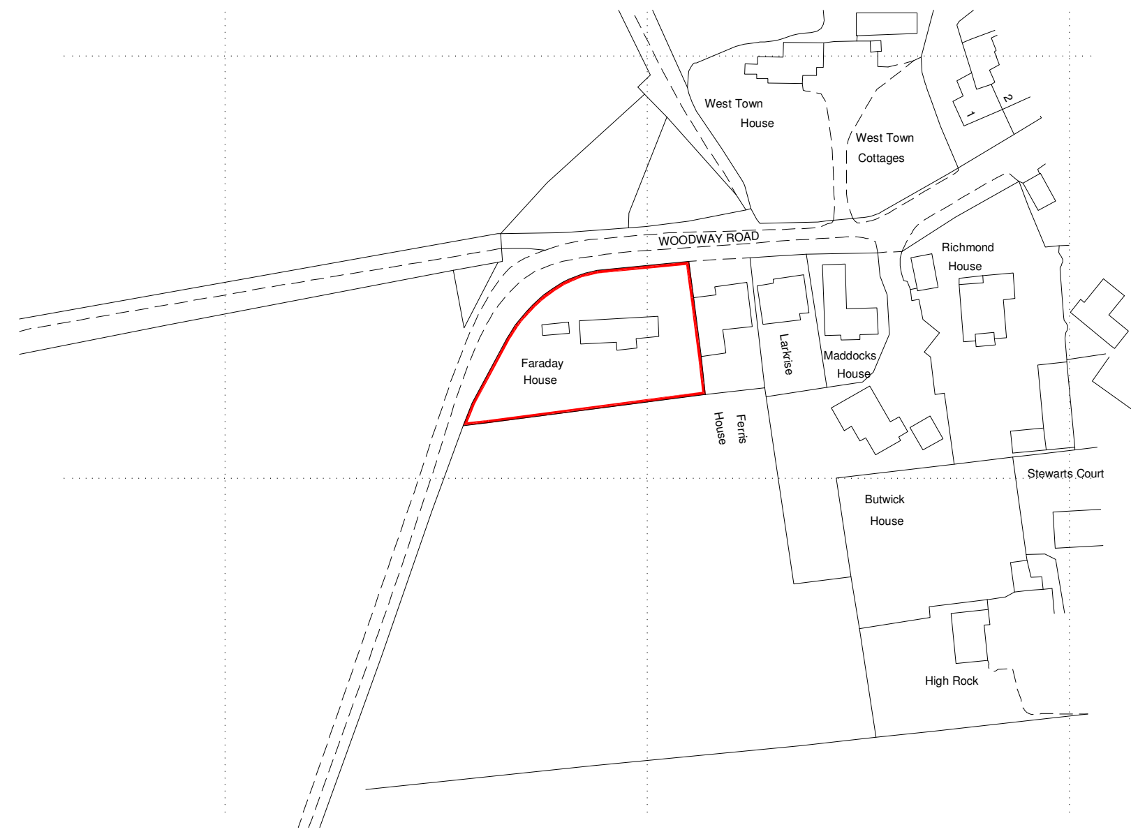
Site Location Plan Scale. 1 : 1250