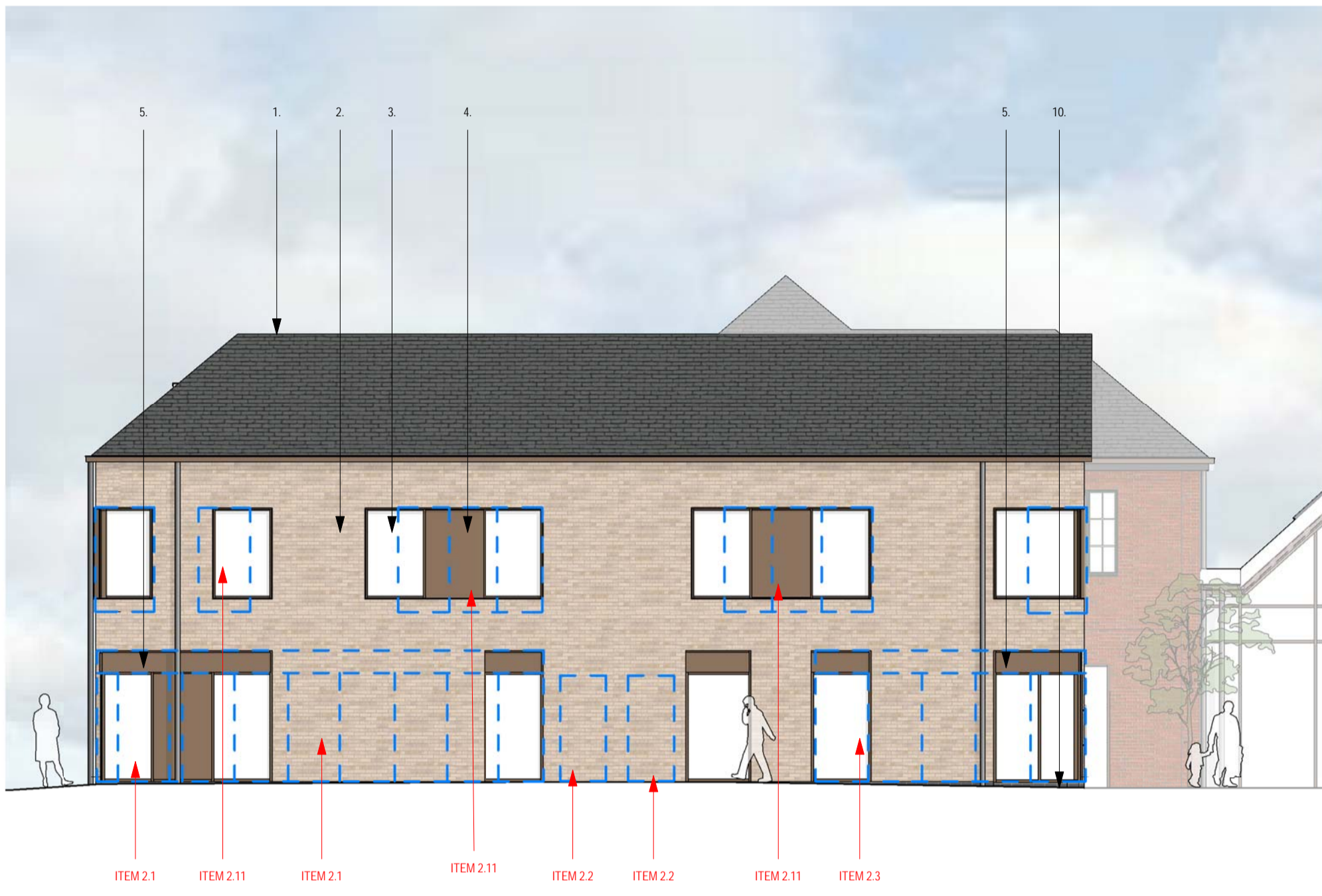
Building 455 - Proposed North Elevation 1 : 100

NOTE: TO BE READ IN CONJUNCTION WITH DESIGN AMENDMENT SCHEDULE FOR DESIGN DEVELOPMENT CHANGES TO APPROVED PLANNING SCHEME. TO BE READ IN CONJUNCTION WITH CORE APPROVED PLANNING DOCUMENTS - 170091/1/16A