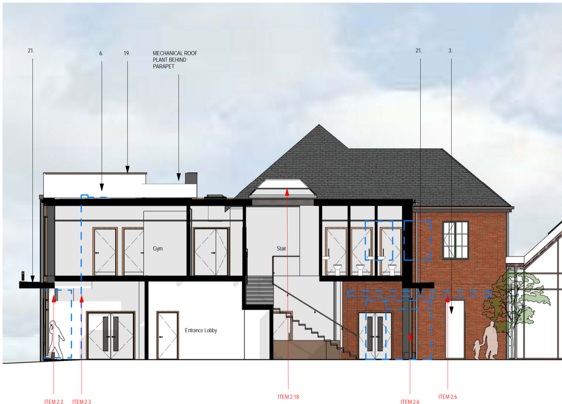
Building 455 - Section AA 1 : 100