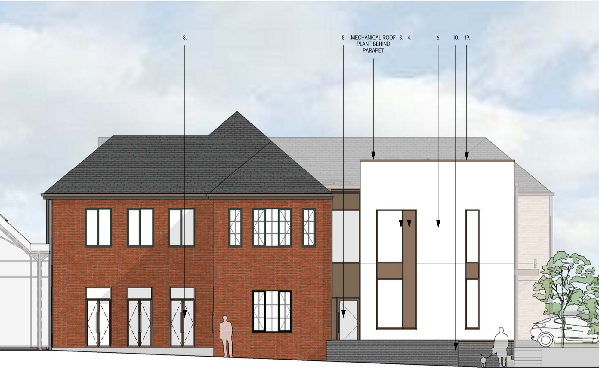
Building 455 - Proposed South Elevation 1 : 100