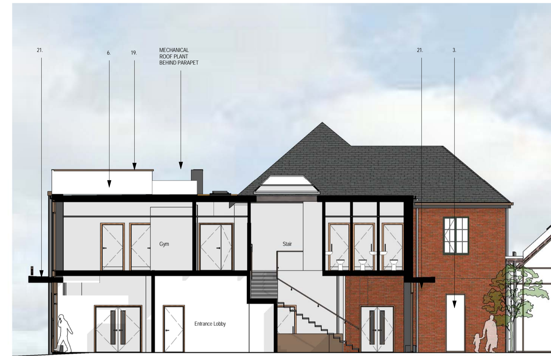
Building 455 - Section AA 1 : 100