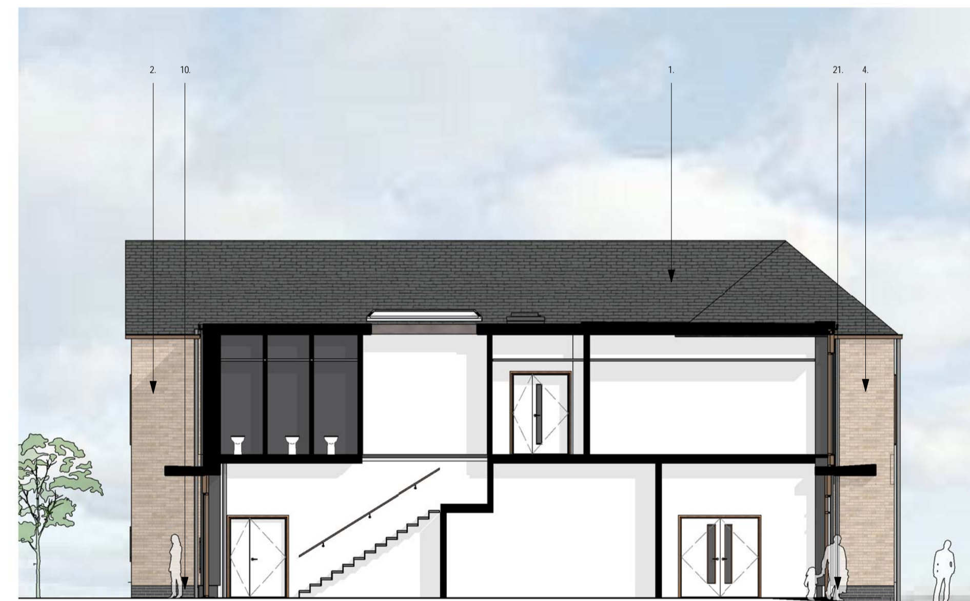
Building 455 - Section BB 1 : 100