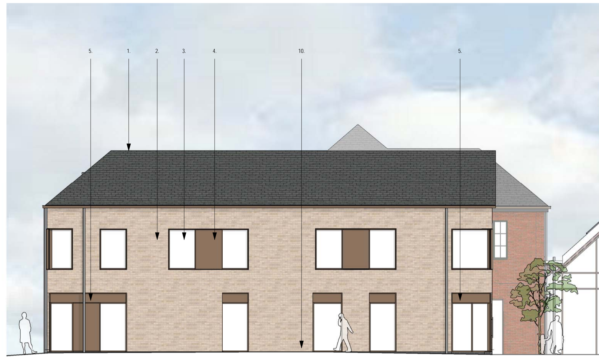
Building 455 - Proposed North Elevation 1 : 100