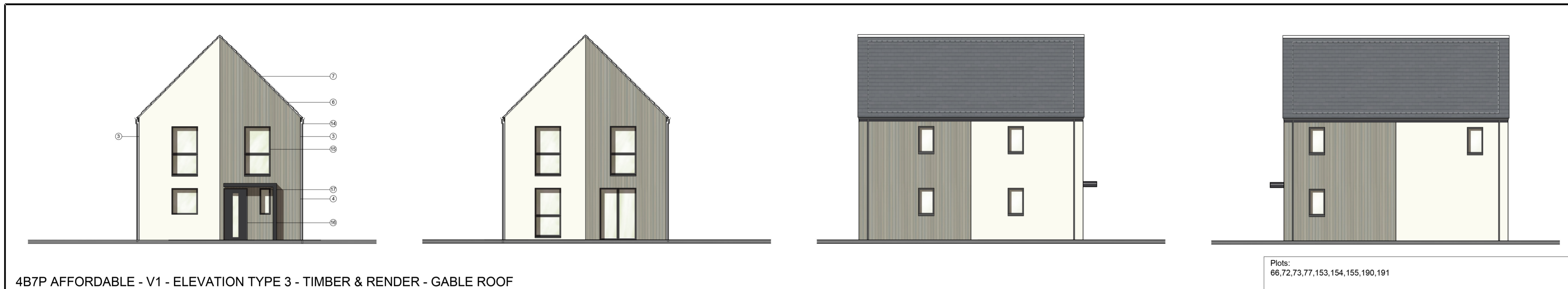
4B7P AFFORDABLE - V1 - ELEVATION TYPE 3 - TIMBER & RENDER - GABLE ROOF