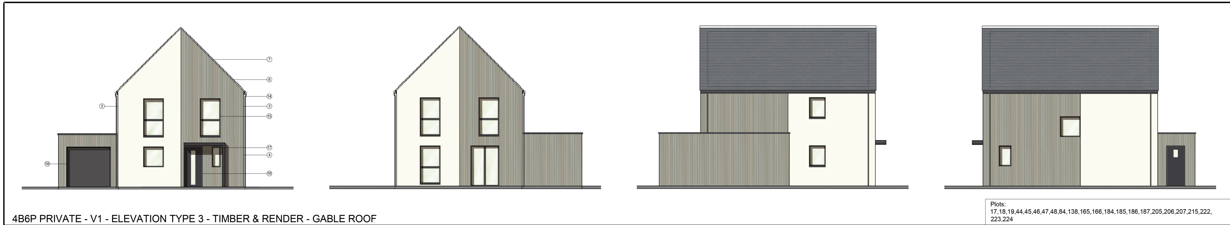
4B6P PRIVATE - V1 - ELEVATION TYPE 3 - TIMBER & RENDER - GABLE ROOF

Plots: 17,18,19,44,45,46,47,48,84,138,165,166,184,185,186,187,205,206,207,215,222,223,224