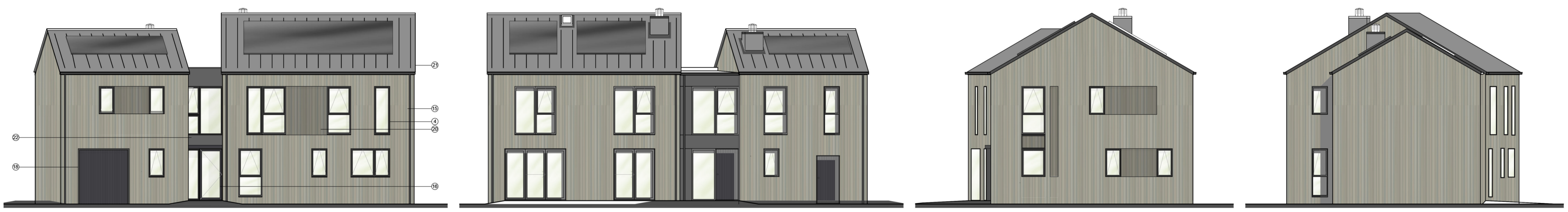
5B10P PRIVATE - V1 - ENRICHED ELEVATIONS - TIMBER - LINEAR ROOF