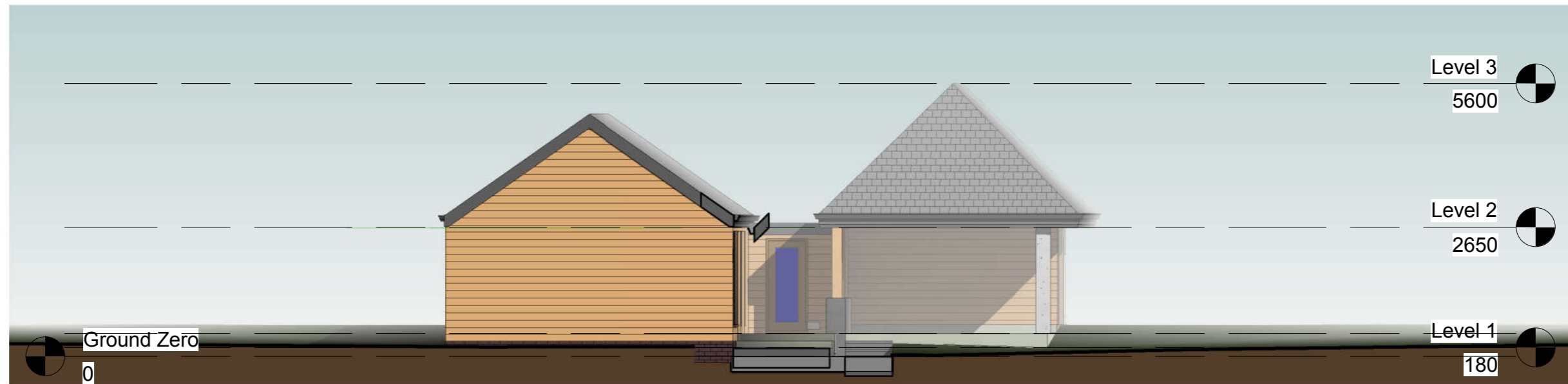
2 West 1 : 100