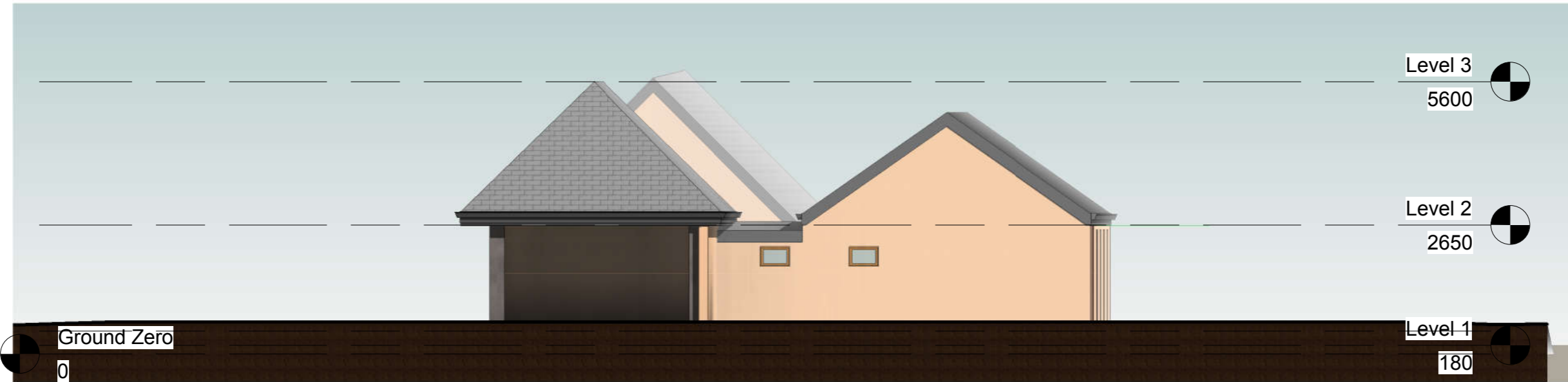
1 East 1 : 100