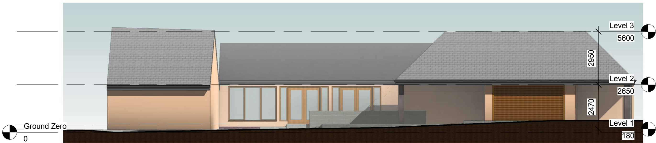
2 South 1 : 100