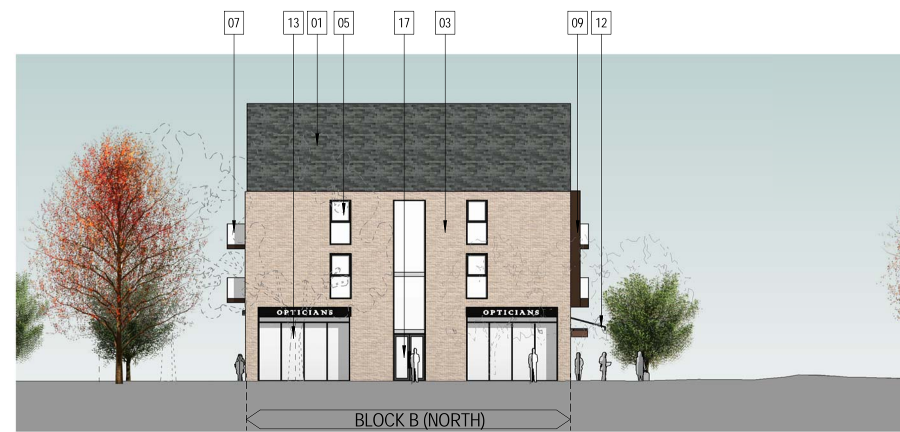
Proposed West Elevation 1 : 200