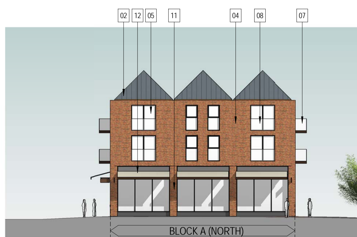
Proposed East Elevation 1 : 200