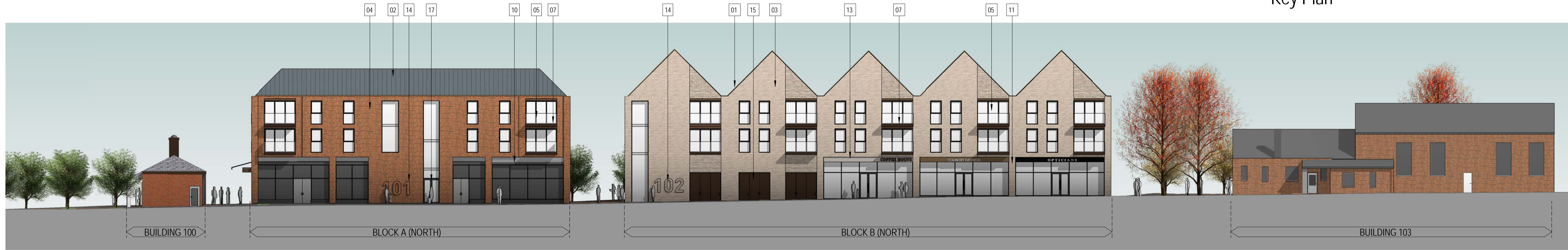
Proposed North Elevation 1 : 200