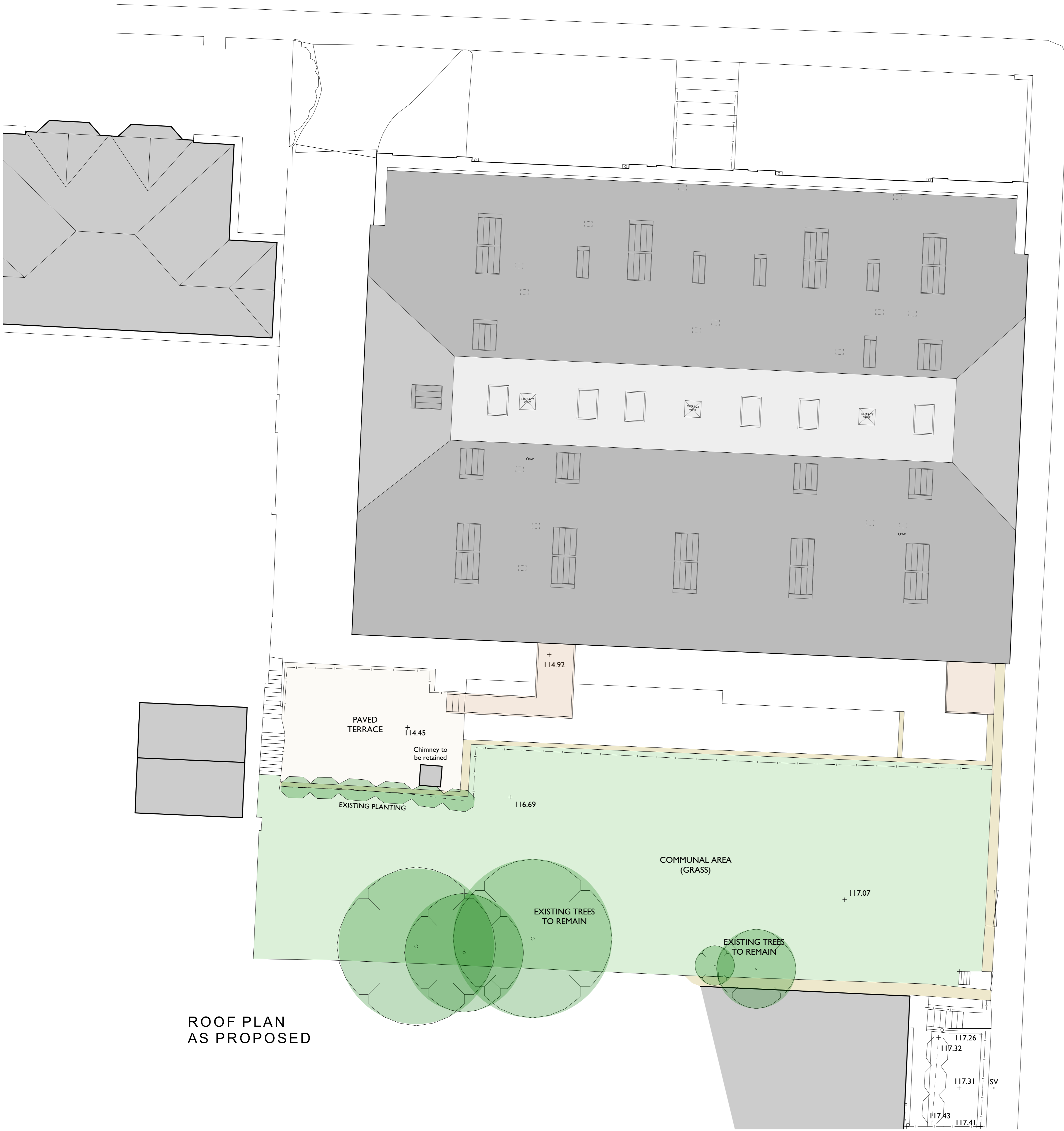
ROOF PLAN AS PROPOSED