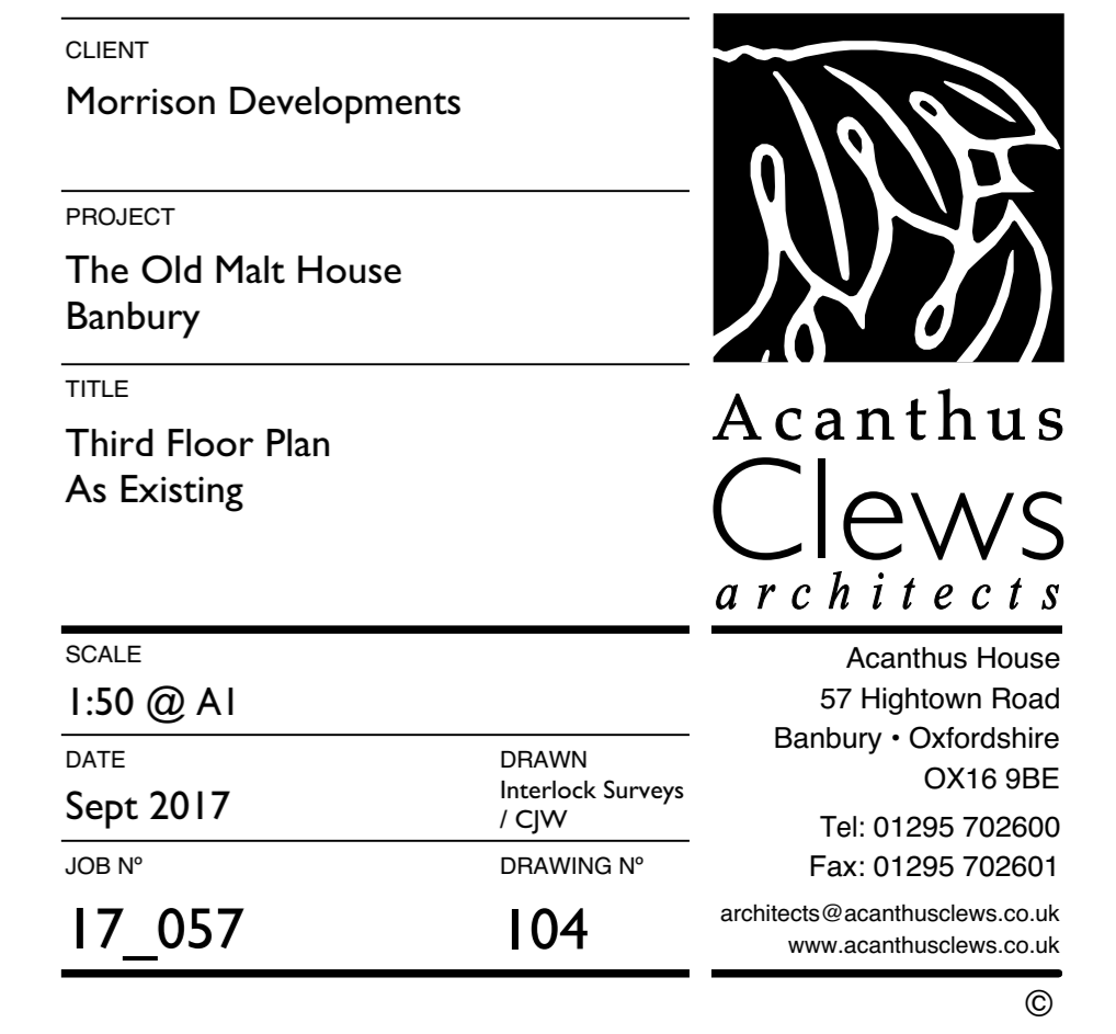
THIRD FLOOR PLAN AS EXISTING