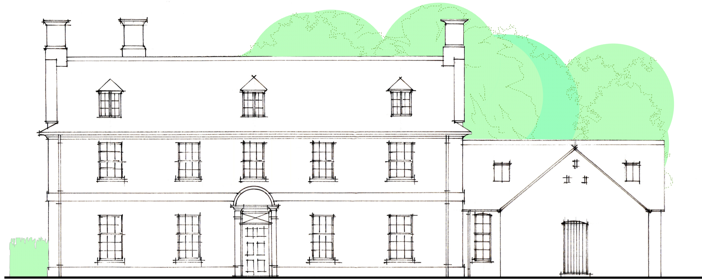
Proposed East Elevation (Front)

General Notes: 1. This drawing is to be read in conjunction with other consultants drawings 2. Check site conditions prior to commencement of work 3. Discrepancies must be reported directly to the Architect 4. Do not scale off drawing, use figured dimensions only 5. This drawing may be issued in colour, and may be a non-standard paper size