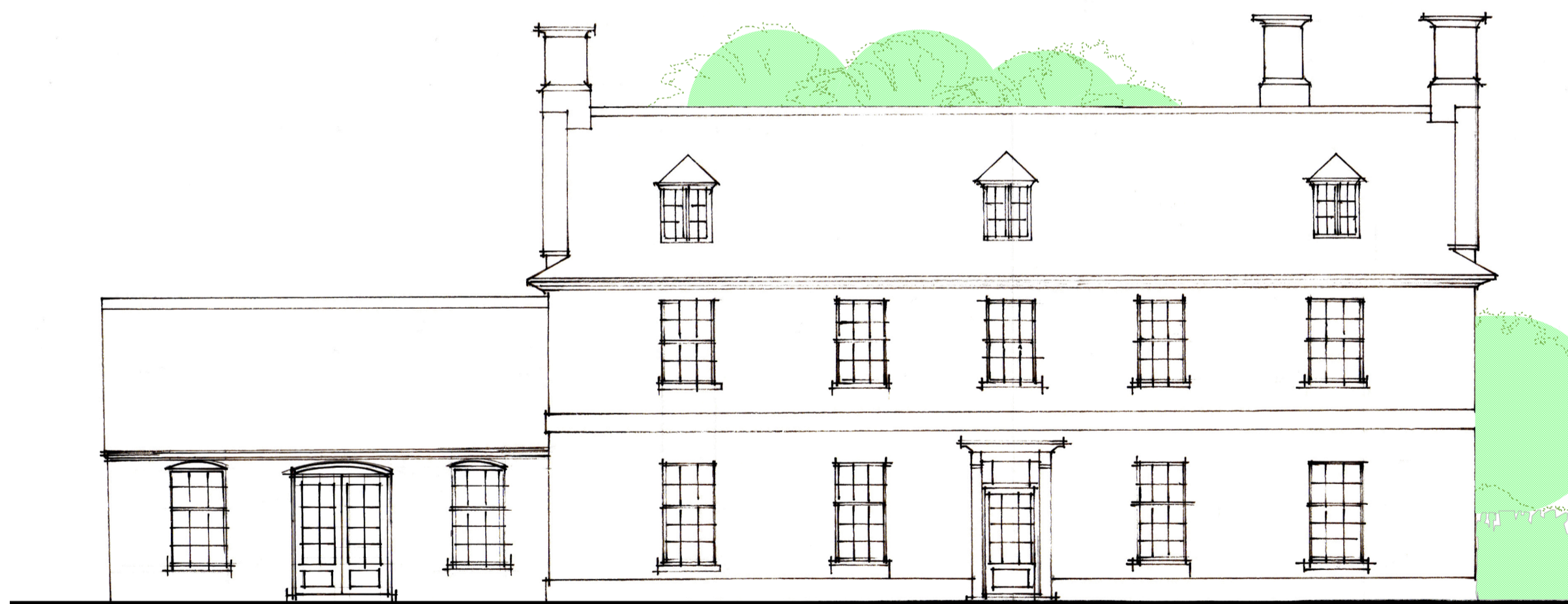
Proposed West Elevation (Garden)