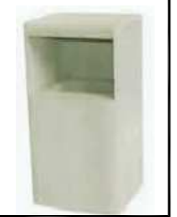
Schwegler safe box No. 17. The safe box is made of stainless steel and is designed to be placed in the corners of the building. The safe box is made of stainless steel.