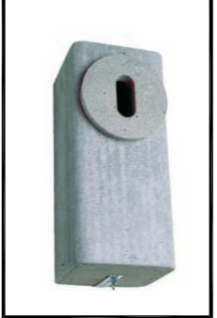
Schwegler ball lock HE - 10 to be incorporated into buildings where adjacent to existing buildings.