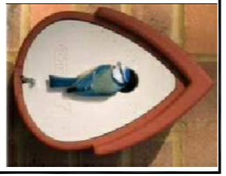
Schwegler Absenz fence box. The fence is made of stainless steel and is designed to be placed in the corners of the building. The fence is made of stainless steel.