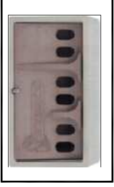
Schwegler Spinnle fence. Spinnle fence is used to create order in the Spinnle fence product range for the fence. It is shown here on a support with a ball box. The fence is made of stainless steel and is designed to be placed in the corners of the building. The fence is made of stainless steel.