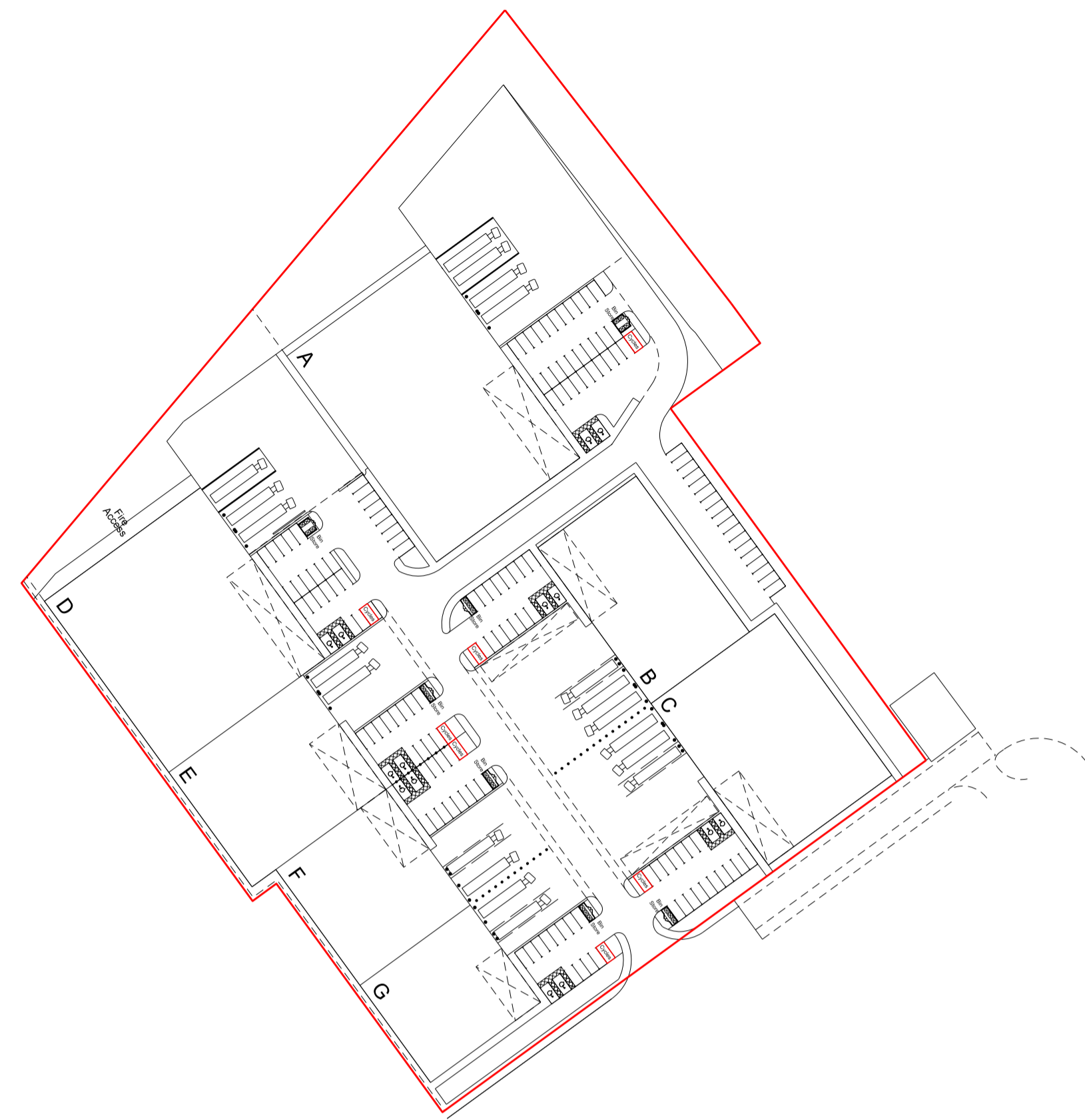
02 SITE PLAN 018 KEY