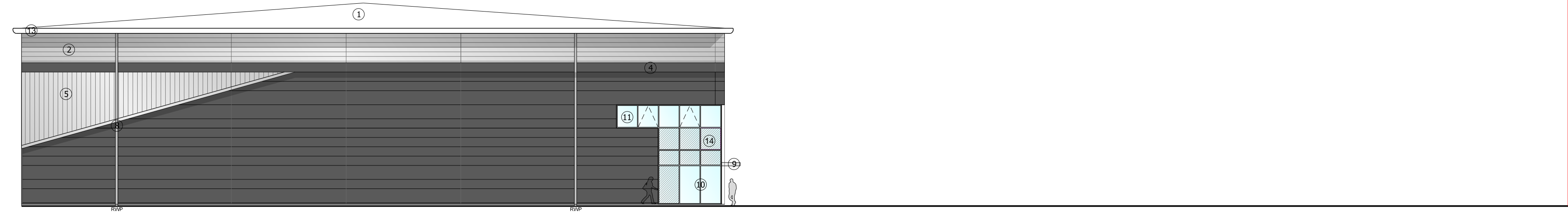
01 South Elevation 2007