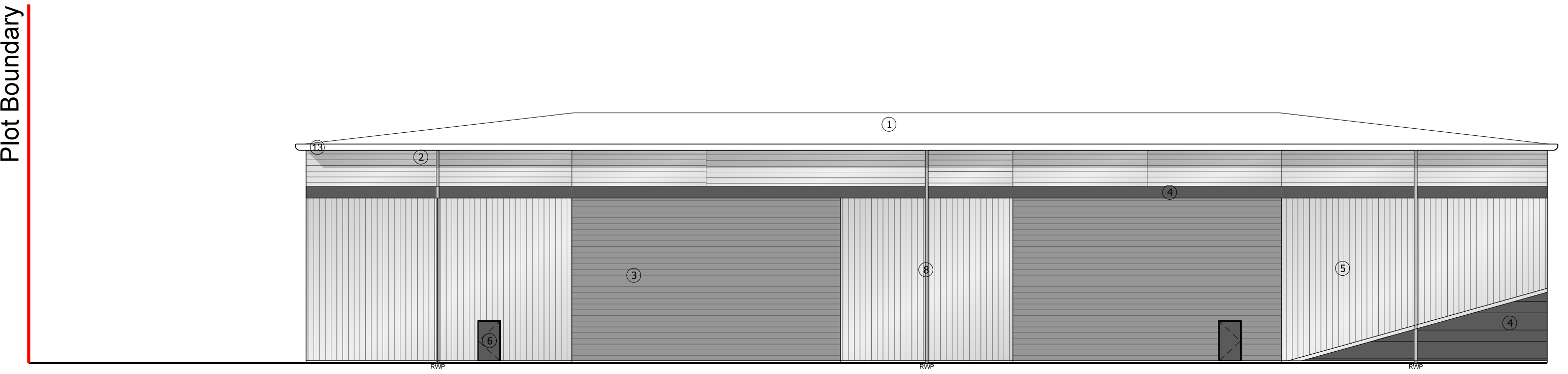
02 West Elevation 2007